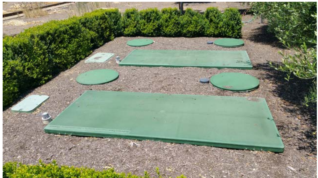
It's not a small area; the flat filter tops are about 6' long and there are usually two tanks.

8) From the memos included in the section "B", the project has been making its way through the other departments at Building and Planning and getting initial review feedback. The wastewater system shown on the civil plan shows the location of the tanks and filters. Orenco drip systems generally need a relatively flat area to place the filters by the tanks. That does not appear to be reflected in the civil plan; how will this be achieved on the hillside where it is shown? Below is an example of what a system would look like at the surface: