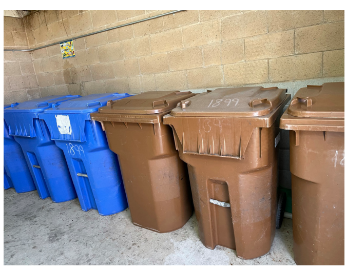
Enclosure with recycling and trash carts