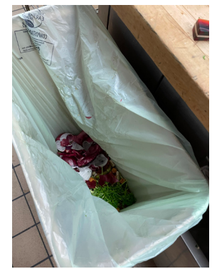
Compost bin inside cafeteria