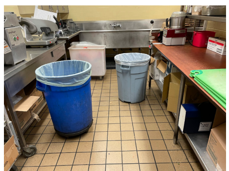
Recycling and trash bins inside cafeteria