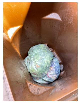
Inside compost cart