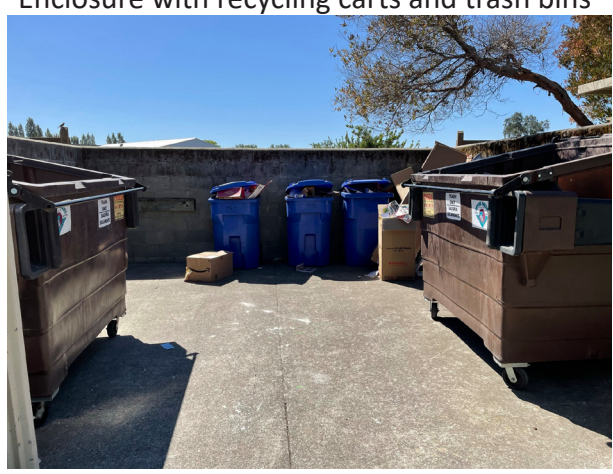
Inside recycling cart

Enclosure with recycling carts and trash bins