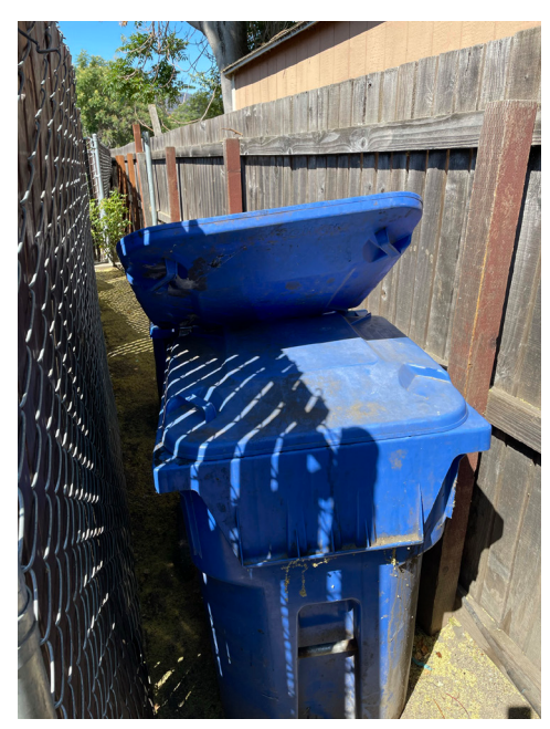
Mixed Recycling Carts

Compost Carts (at curb, it was service day)