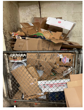
Cardboard sorting (comes down from cafeteria via trash shoot)