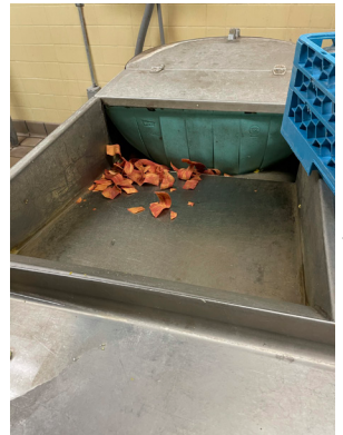
Plates scrapings and leftovers from cafeteria are put into this