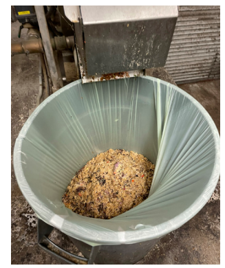
After the photo on the left, the food is ground and goes into this, which then goes into compost carts