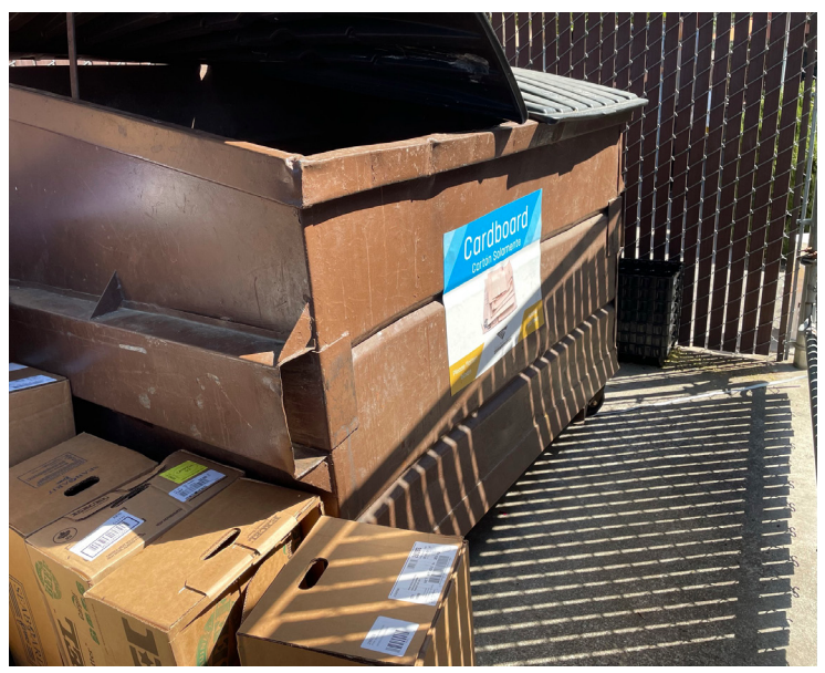
Cardboard Only Bin

Azteca Market in St Helena Azteca Market is using the commercial compost program, as well as source separated cardboard and mixed recycling with Upper Valley Disposal & Recycling. I will be working with them on how to comply with AB 827. They did make one attempt but found the compost stream too contaminated to be added to the UVD&R compost carts.