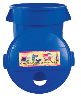
32 gallon recycling can

Printed on 100% post-consumer recycled paper • 01/17