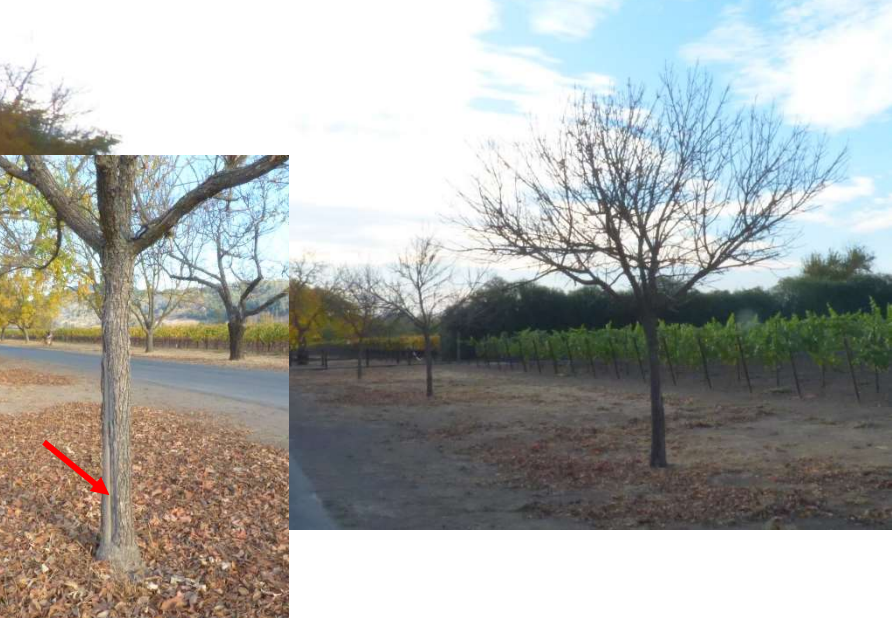
Photo 6. A few trees have been replaced with a species I could not identify as being walnut, since they have an opposite branching habit. These trees range from 6" to 8" diameter and are about 10 years old. They each have sunburn injuries on the west side, which is a symptom of lack of adequate water while the trees were being established (inset, red arrow).

The soil is compacted along the edge of the road, and for the most part it is kept dry around the trees.