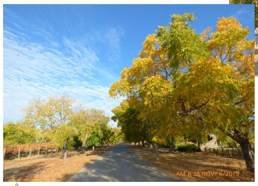
Photo 4. Some of the trees are in good condition, especially those on the east side of the road, near residences where soil moisture is more optimal.

Photo 3 . Additionally, the trees on the east side have high voltage lines (Yellow arrow) over them, requiring pruning by PG&E to maintain 15' of clearance away from the foliage. Note the dead branches and injury on the lower trunk of this tree (Red arrows).