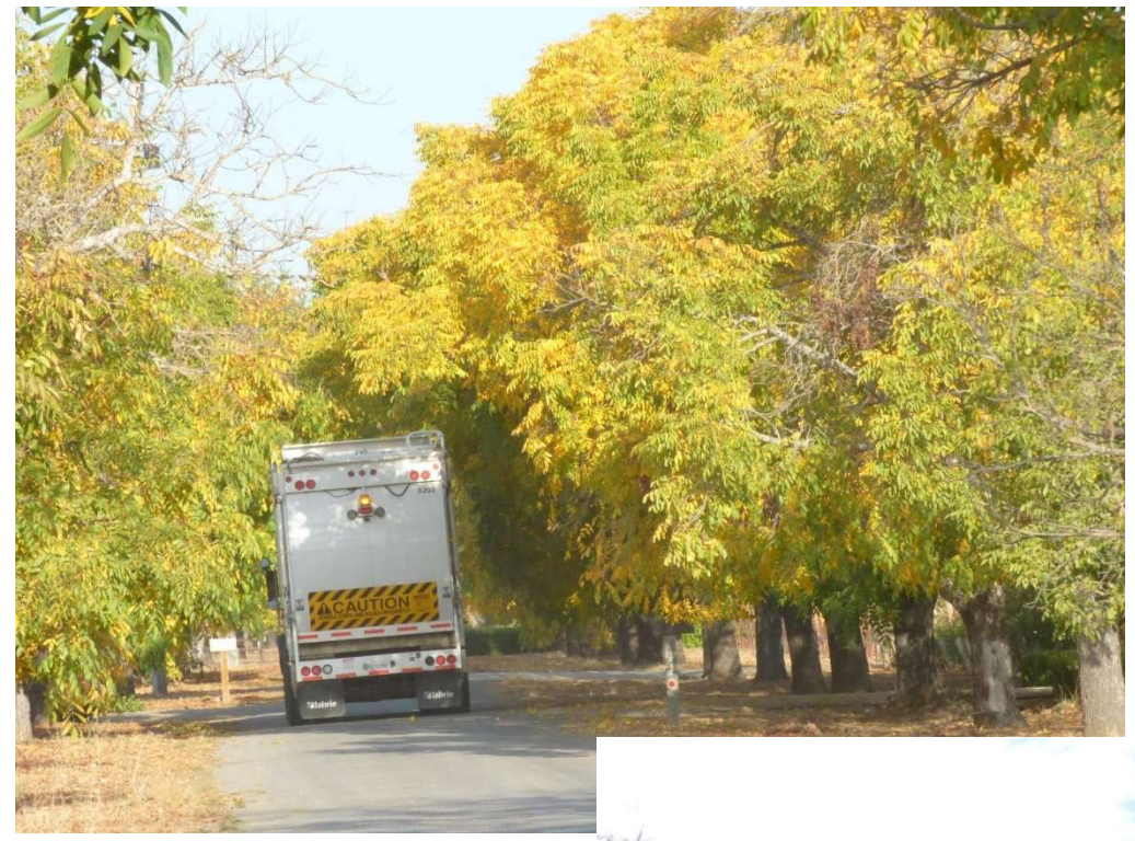
Photo 5. Foliage of some of the trees is growing over the road, and can present a problem for large trucks, and delivery vehicles. County and State regulations generally require trees to be shaped and elevated to provide 15' of clearance for this reason.

The soil is compacted along the edge of the road, and for the most part it is kept dry around the trees.