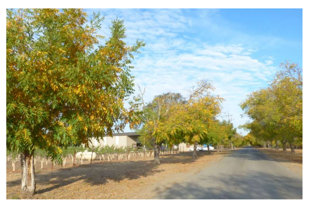
Photo 1 . Close to the south end of the road, looking north toward the first vineyard building, which can be seen on the left.

<sup>1</sup> Diameter at Breast Height, or DBH, is measured at the standard height of 4.5' above the ground.