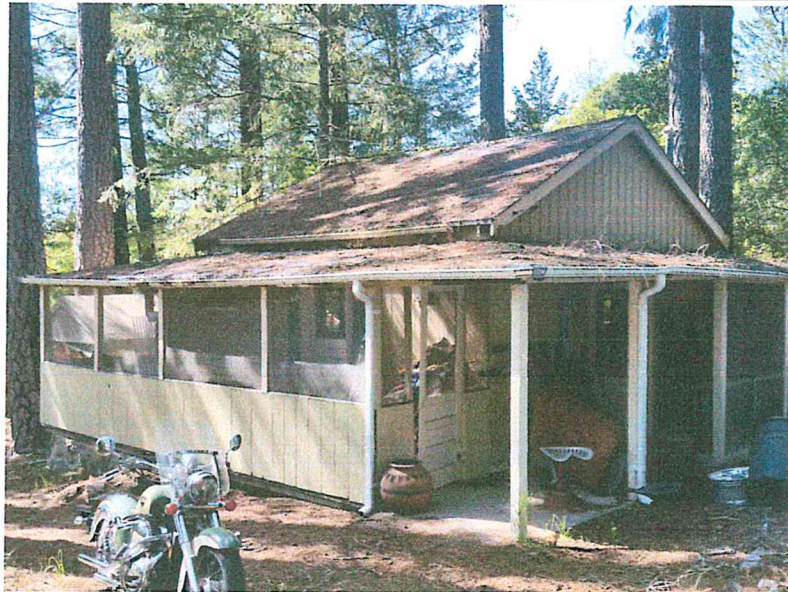
Figure 1. Front elevation of cottage.

The Cottage is a side gable single story wood frame cottage in a forest setting. It appears to have been built as a "summer cabin" or accessory dwelling unit, originally without a kitchen or bathroom. The era of construction is about 1900-1920. The cottage has been modified with screen porch extensions on 3 sides. It is difficult to tell the original extent of the porch, but most likely this front elevation had a full width porch. A kitchen and bathroom were eventually added, with varying kinds and styles of siding used. Rock infill was added under the pier and post foundation to prevent vermin from entering the structure. The cottage is in poor to very poor condition.