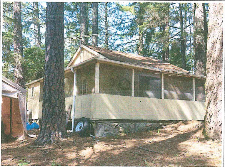
Figure 3. Screened porch additions and enclosure showing rock infill between the post and pier foundation.