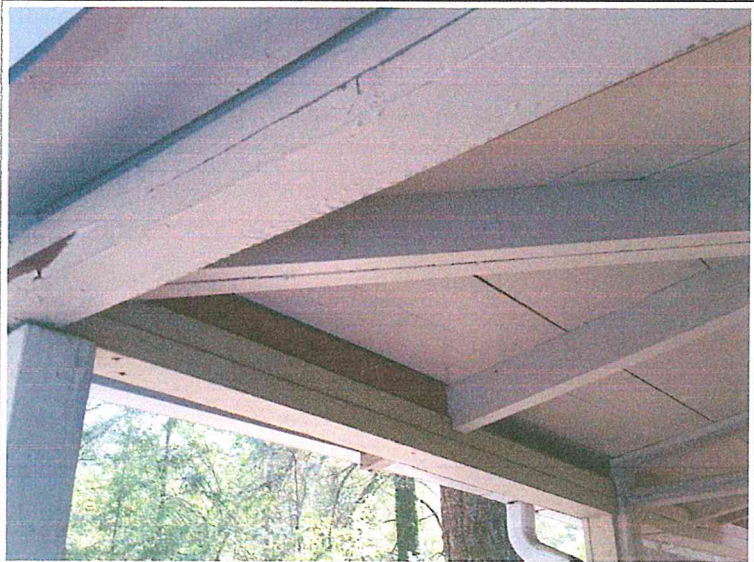
Figure 4. Screened porch roof framing.