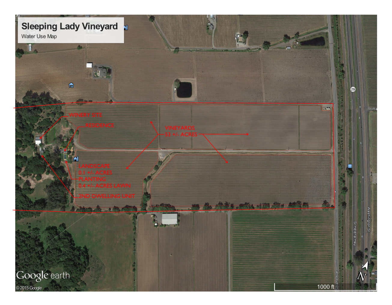
Figure 2: Water Use Map

Groundwater is currently used to irrigate approximately 53 acres of vineyard and 0.5 acres of landscaping as shown in Figure 2.