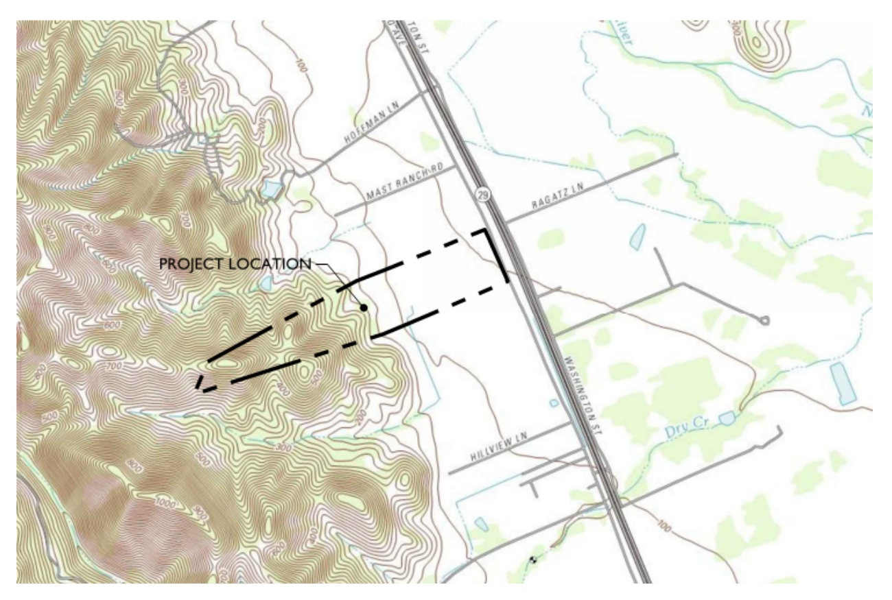
Figure I: Location Map

Sleeping Lady Vineyard LLC is applying for a Use Permit to construct and operate a new winery at their property located at 5537 Solano Avenue in Napa County, California. The subject property, known as Napa County Assessor's Parcel Number 034-170-005, is located along the west side of Solano Avenue proximately 0.6 miles south of the intersection of Hoffman Lane and Solano Avenue.