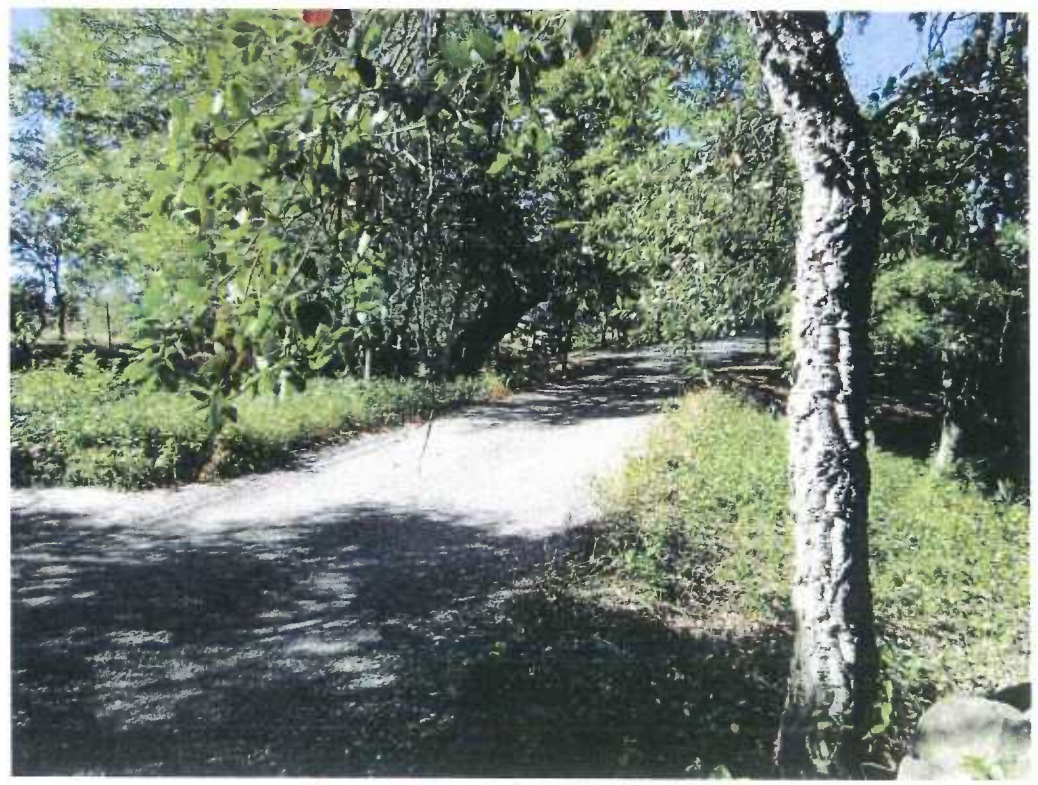
Western Approach to Existing Bridge