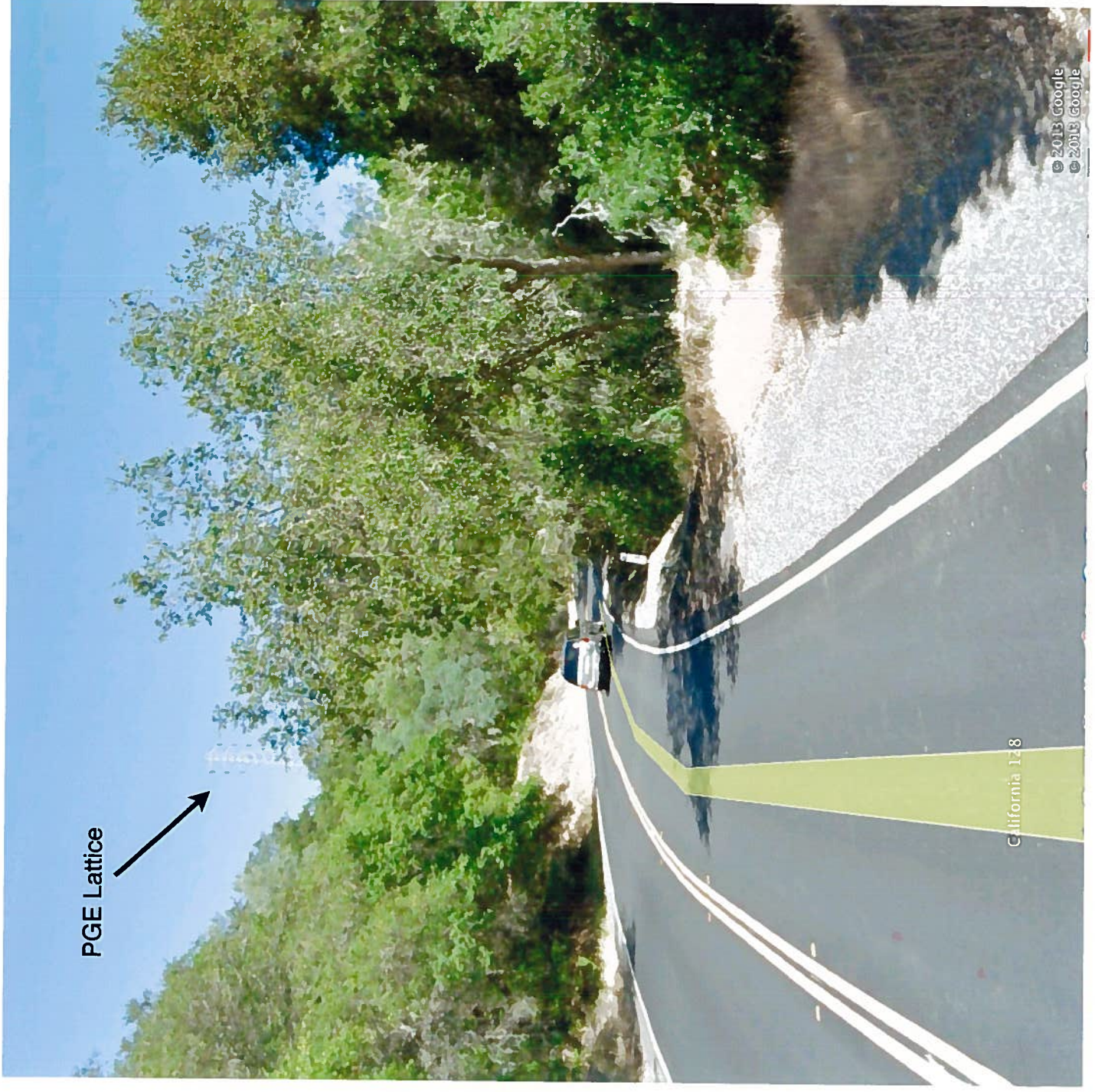
Traveling Along Hwy 128/Sage Canyon Road - Existing PGE Lattice Towers are visible