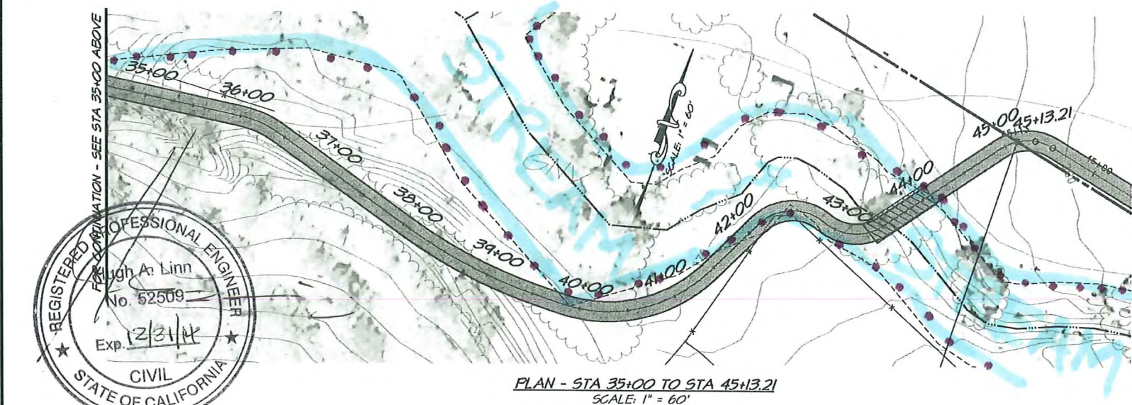
PLAN - STA 35+00 TO STA 45+13.21 SCALE: 1" = 60'