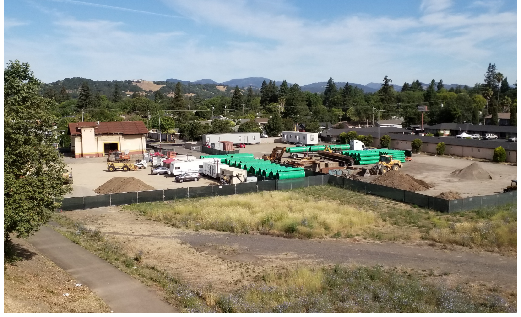
NapaSan Board of Directors Meeting – July 15, 2020