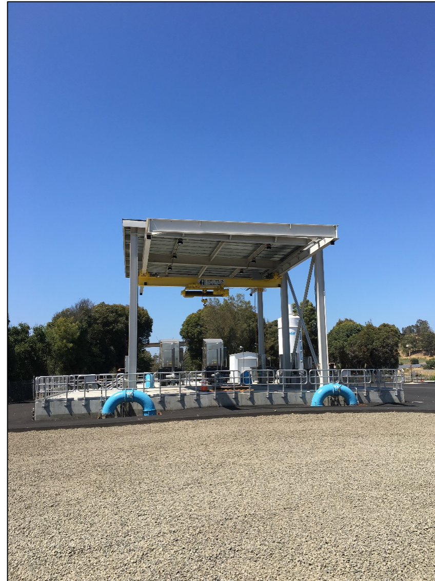
July 15, 2020