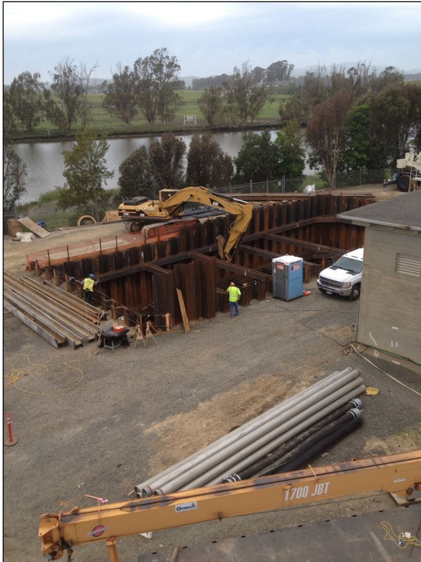
NapaSan Board of Directors Meeting