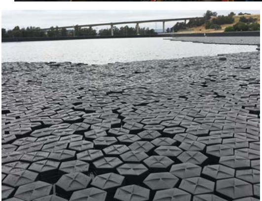
Installation of the floating covers on the recycled water reservoir at the Soscol Water Recycling Facility.