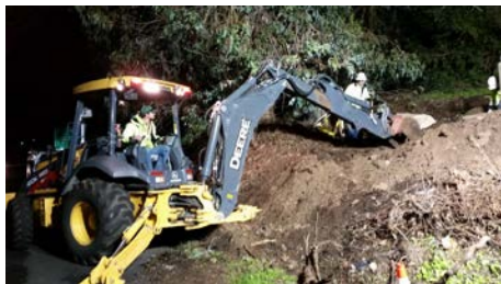
Sewer repair on Silverado Trail

The goal is to maintain a dynamic and skilled workforce through employee engagement, professional development and opportunities for advancement. The NapaSan Board wants to create a positive and respectful working environment that encourages all employees to do the best job possible for the NapaSan ratepayers.