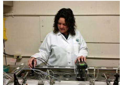
Lab analyst conducting bioassay test

The goal is to provide ratepayers with the information they need to understand NapaSan’s mission, operations, finances and rate structures. The Board wants to ensure that NapaSan operates in a transparent manner and serves as a resource to all ratepayers of the service area.