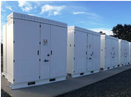
Stationary storage batteries used to store energy during the night for use during the day, decreasing energy demand charges