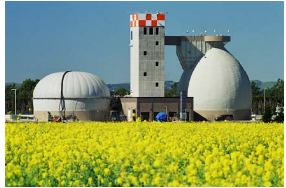
Soscol Water Recycling Facility

NapaSan, located in the Napa Valley in Northern California, has been serving the public since it was organized under the California Health and Safety Code in November 1945.