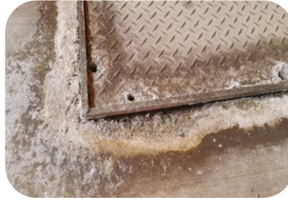
CORROSION - REHAB