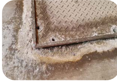
CORROSION - REHAB