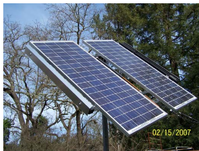
Photo voltaic electrical system installed without permits.