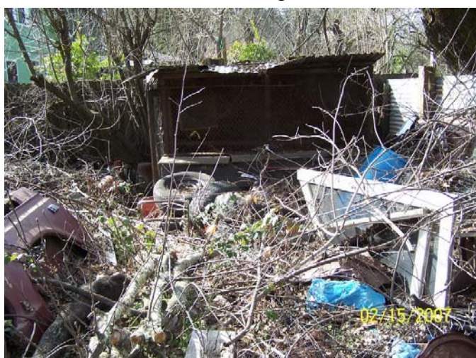
Debris and combustible materials