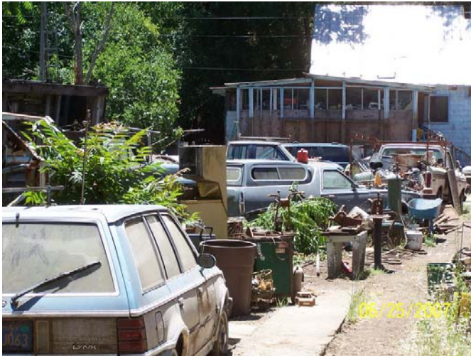
Scrap metal and debris

The following photos were taken during a site inspection on Monday June 25, 2007. Some progress was made removing materials and unsafe structures from the property, however the shed converted to a dwelling remains.