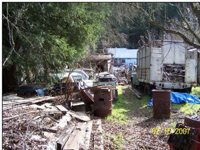
Combustible material storage