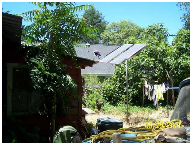
Shed converted to dwelling remains and possibly occupied.