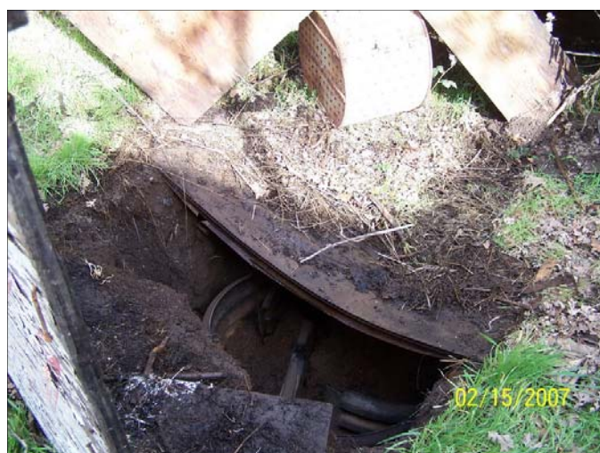
Grey water systems installed without permits.