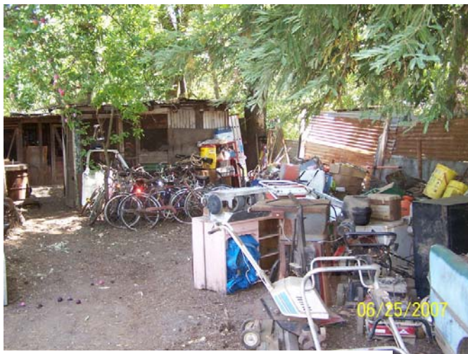
Storage of household items