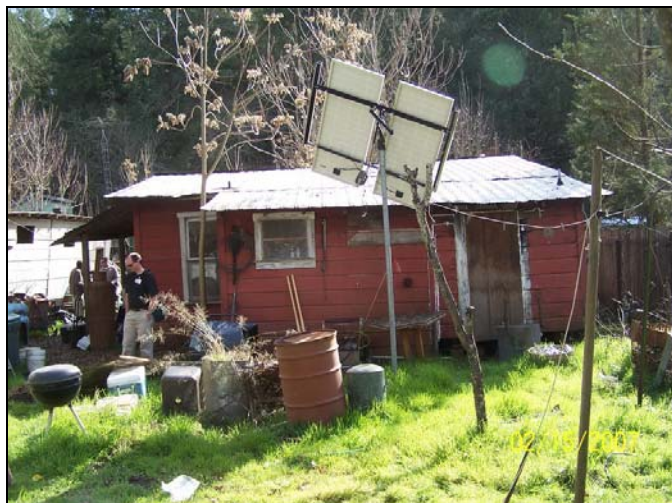
Shed converted to dwelling without permits Electrical and plumbing building violations.

The following are photos were taken on February 15, 2007 of the converted shed to dwelling.