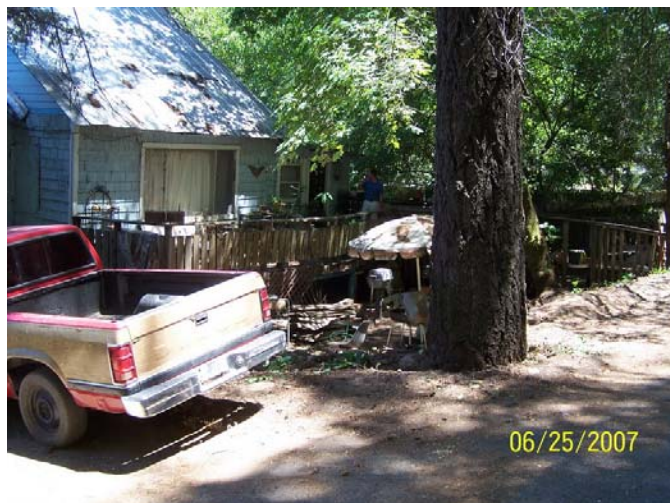
Front yard partially cleaned-up