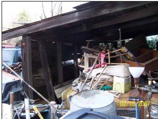
Storage of household materials