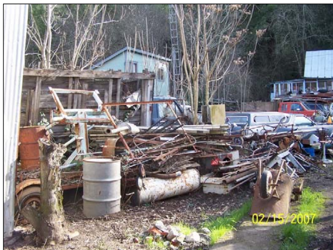
Storage of metal and debris

The following are photos taken on February 15, 2007 of the exteriors portions of the property during a multi- departmental inspection.