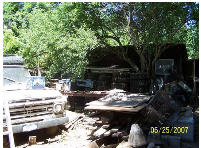
Storage of lumber and debris