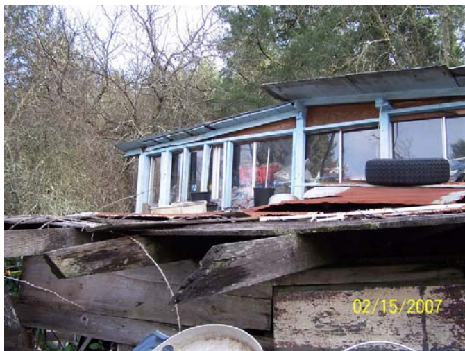
Failing lean-to and porch.