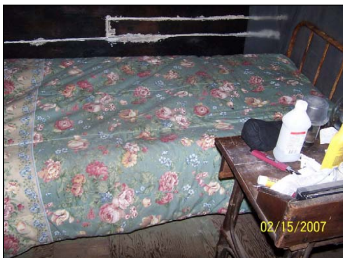
Interior of Shed converted to dwelling