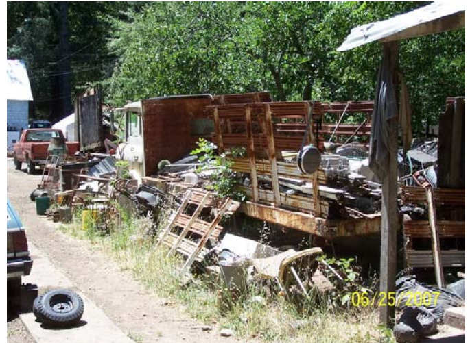
Scrap metal and debris