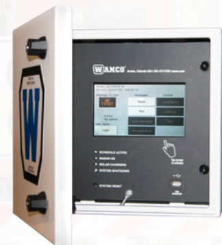
In-Cabinet Controller (location shown below)