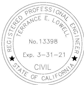
EXHIBIT E: An assessment roll, showing the amount proposed to be specially assessed against each parcel of real property within this assessment district.

EXHIBIT D: A map showing all the parcels of real property within CSA No. 4.