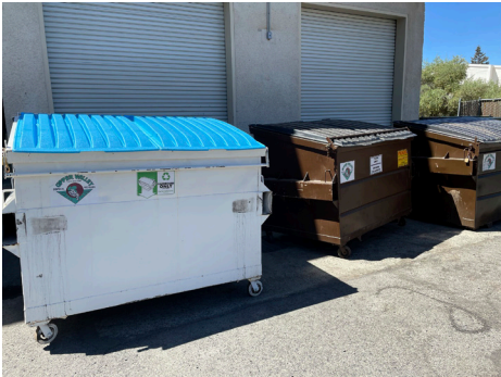
Cardboard only & Trash bins at PUC

Pacific Union College (PUC) in Angwin PUC signed onto service with UVD&R in July 2020 after self hauling and running their own sorting facility for many years. I did a site visit at the cafeteria and the market that are both owned by PUC. They have commercial compost, source separated cardboard and mixed recycling with UVD&R.