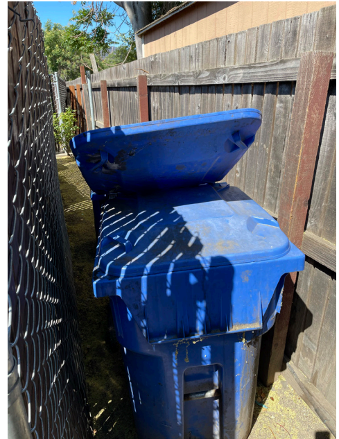
Mixed Recycling Carts