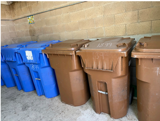
Enclosure with recycling and trash carts