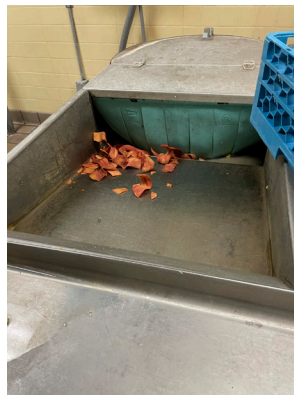
Plates scrapings and leftovers from cafeteria are put into this