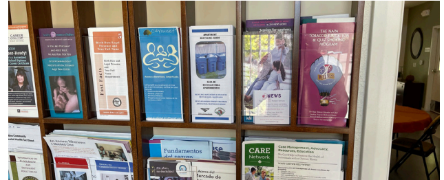
Recycling brochure in rack in community room