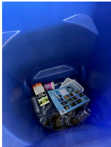
Inside recycling cart