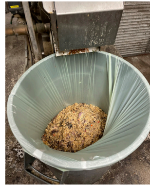
After the photo on the left, the food is ground and goes into this, which then goes into compost carts

Cardboard stacked for recycling at the market. I did advise them to not mix waxed cardboard with regular cardboard