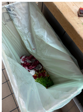
Compost bin inside cafeteria