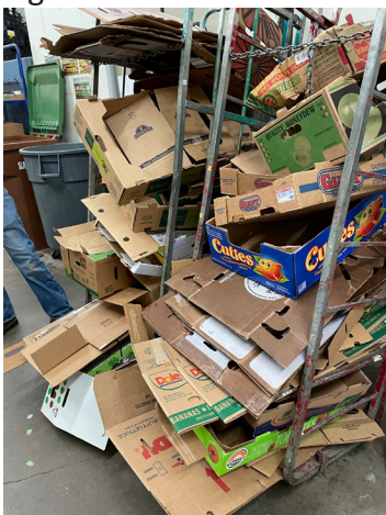
Compost cart in produce prep area at market

Cardboard stacked for recycling at the market. I did advise them to not mix waxed cardboard with regular cardboard