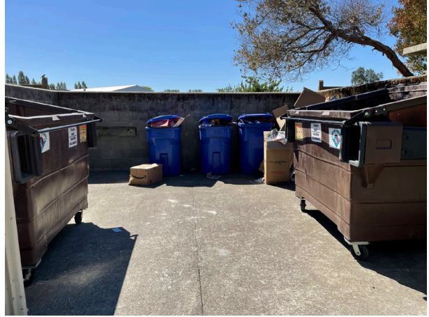
Enclosure with recycling carts and trash bins