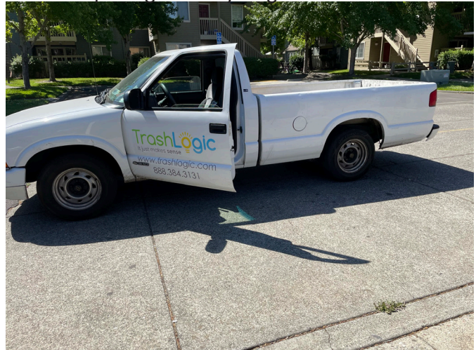
TrashLogic staff were on-site when I was there, cleaning up enclosures and pulling out recycling carts for service