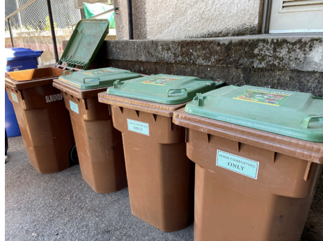
Compost carts and Mixed Recycling Carts at PUC