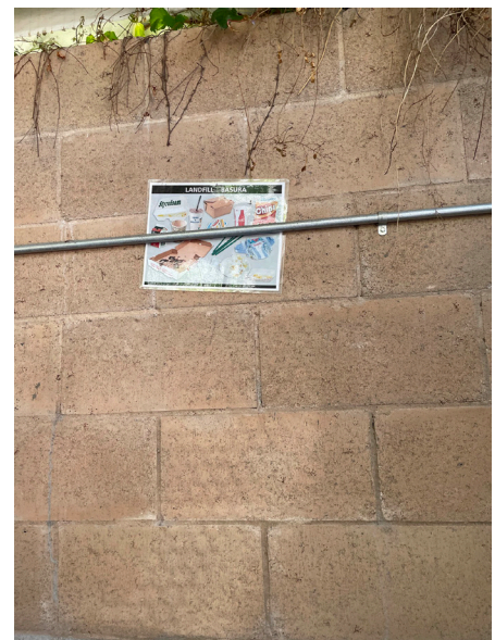
They have laminated signs in the trash enclosures, I will be providing updated signs