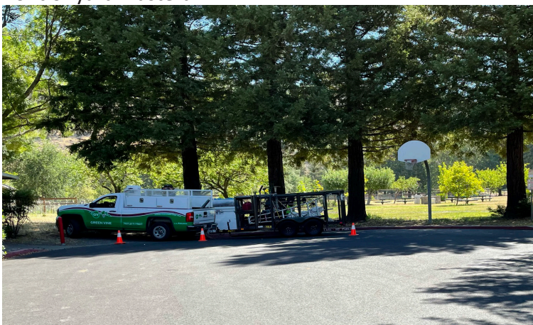
Landscaping company was there when I was, they are parked in front of yard waste bin