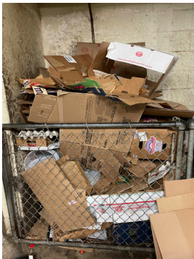
Cardboard sorting (comes down from cafeteria via trash shoot)