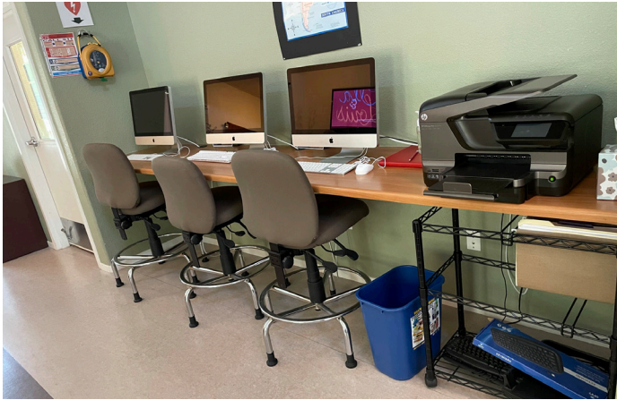
Recycling in the community room

Arroyo Grande Villas in Yountville Arroyo Grande Villas in Yountville is a 25 unit apartment complex run by Napa Valley Community Housing. They use a landscaping company that takes yard waste with them to a compost facility. They have some recycling bins in the community room. There are two enclosures for residents with trash and recycling carts. I plan to coordinate with them for adding on green compost carts, for residents to separate food and food soiled paper. They offer educational opportunities for residents so this is a perfect opportunity to fine tune a method for education of multi family properties on compost.