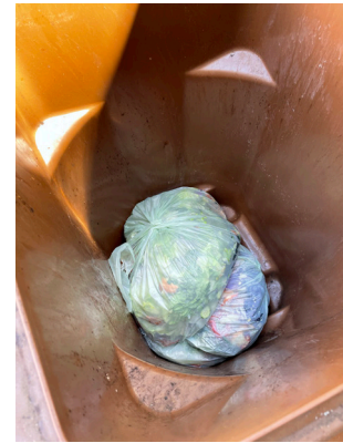
Inside compost cart