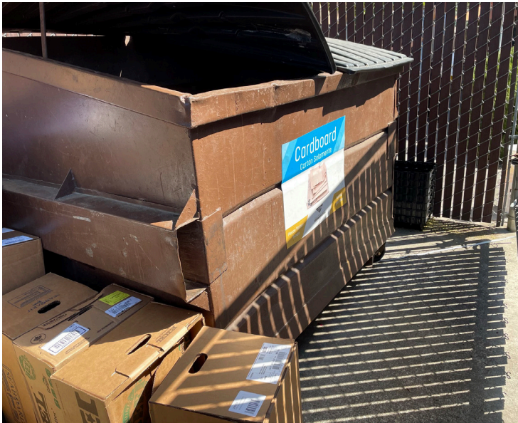
Cardboard Only Bin

Azteca Market in St Helena Azteca Market is using the commercial compost program, as well as source separated cardboard and mixed recycling with Upper Valley Disposal & Recycling. I will be working with them on how to comply with AB 827. They did make one attempt but found the compost stream too contaminated to be added to the UVD&R compost carts.