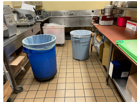
Recycling and trash bins inside cafeteria