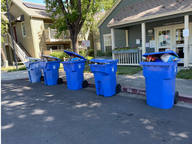
Recycling carts set out for service