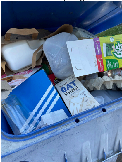
Inside recycling cart