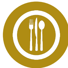
Commercial Edible Food Generators