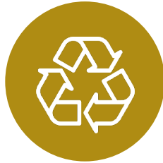
Recycled Organic Waste Procurement