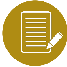
Recycled Paper Procurement