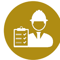
Jurisdiction Inspection & Enforcement