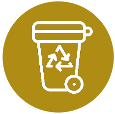
Organic Collection Services