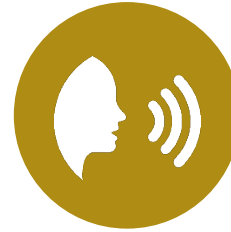
Education & Outreach