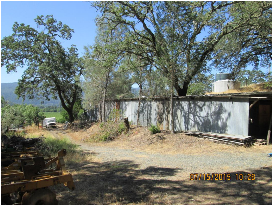
Figure 5. Trees along existing building to be removed.