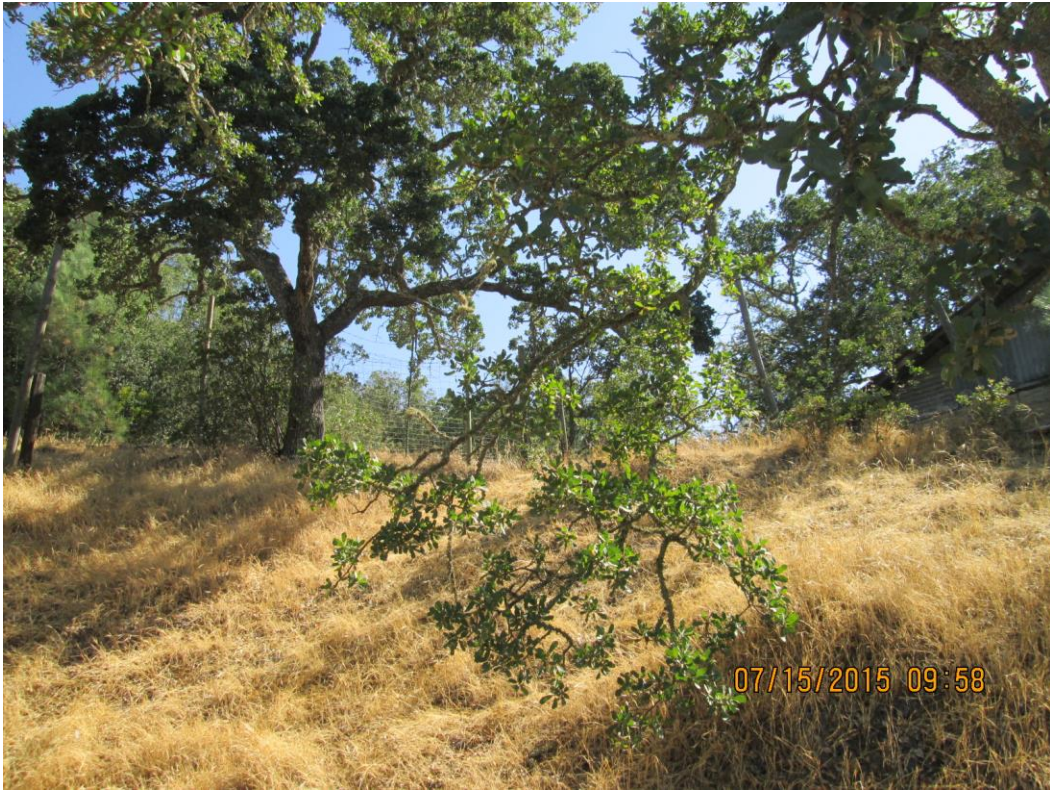
Figure 2. Example of blue oak woodland.