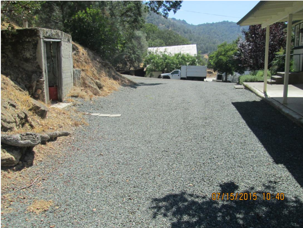
Figure 7. Location of new building.