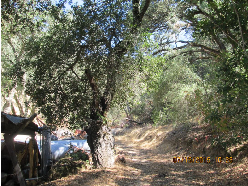
Figure 4. Looking north in project site.