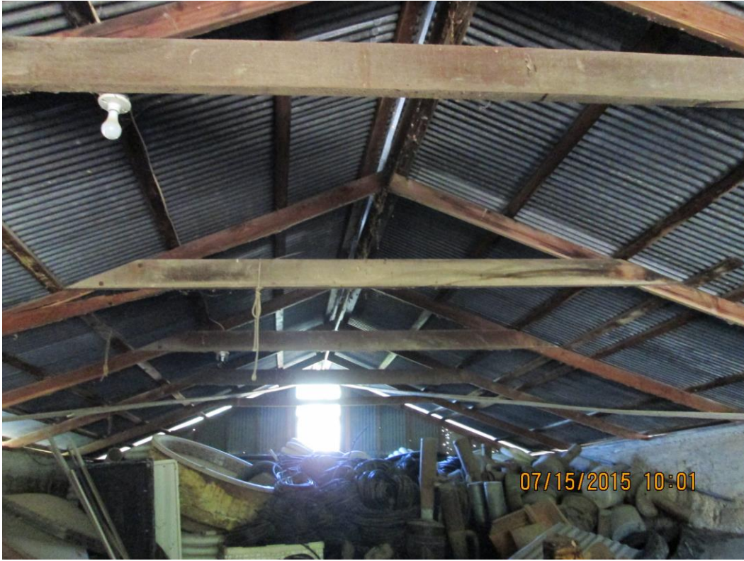
Figure 6. Rafters of building to be replaced. Suitable potential bat habitat occurs in this building.