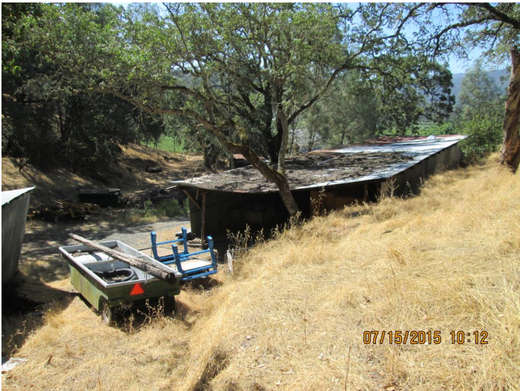
Figure 3. Trees around building to be replaced.