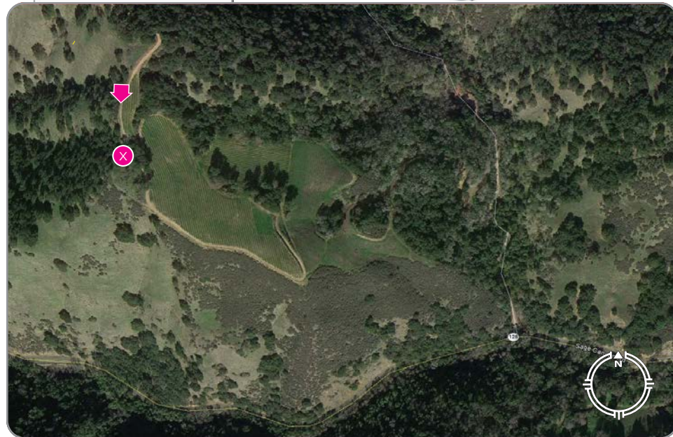
View from the North looking South