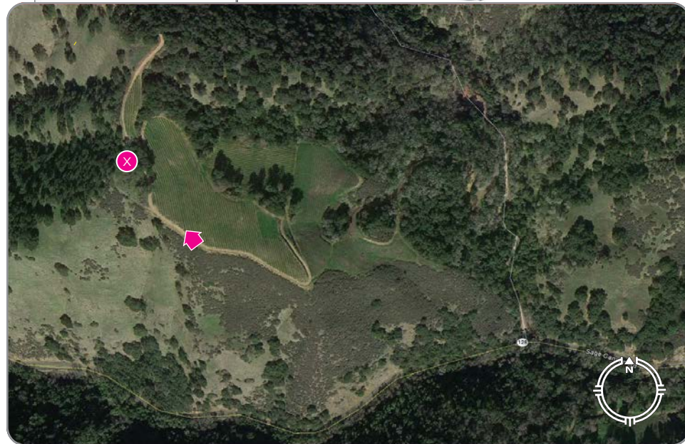
View from the Southeast looking Northwest