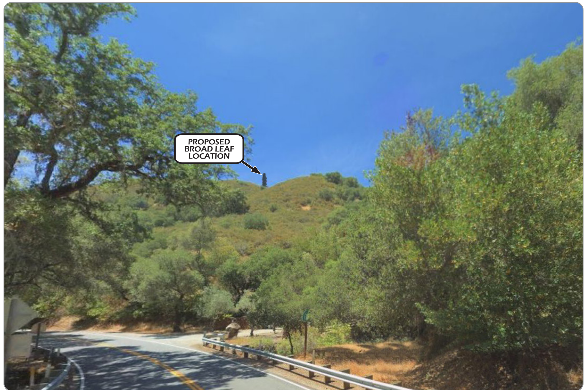
Completed January 17, 2019