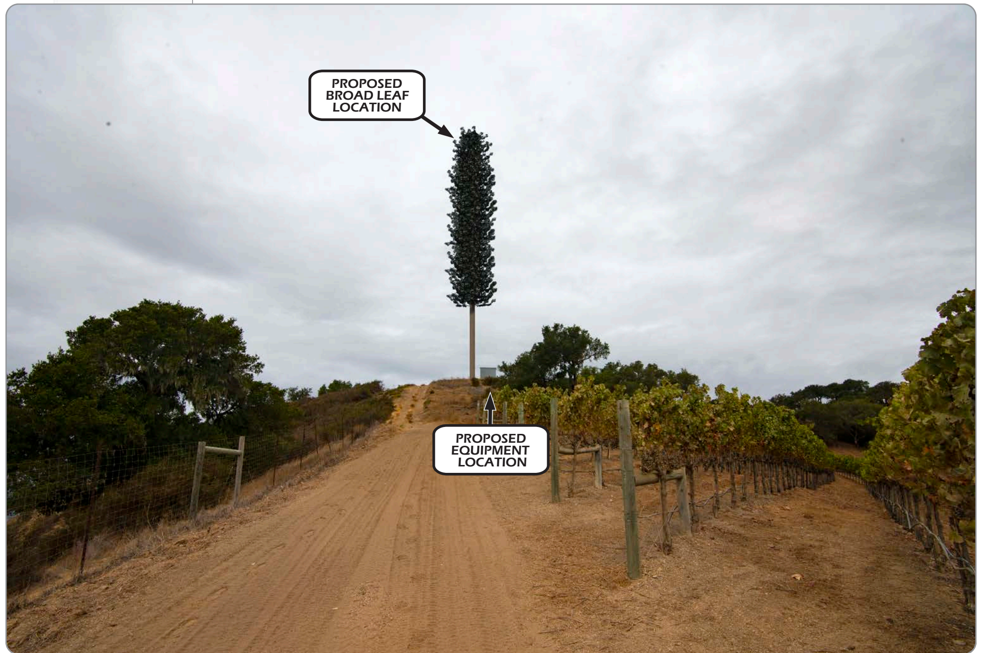
Completed January 17, 2019