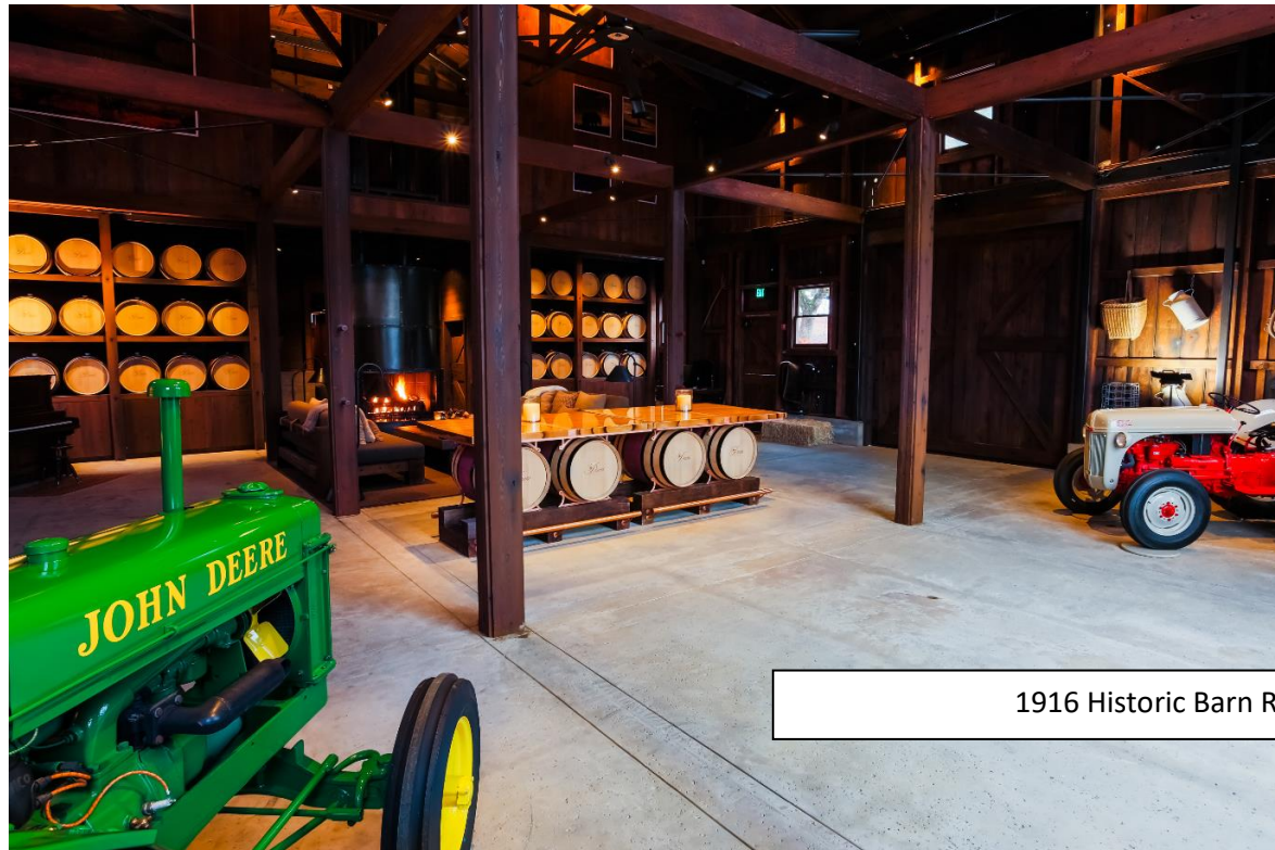
1916 Historic Barn Restored