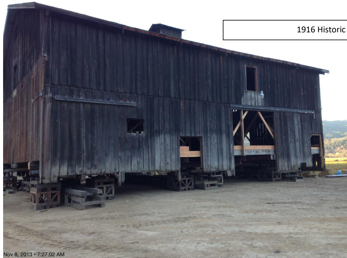
1916 Historic Barn Before