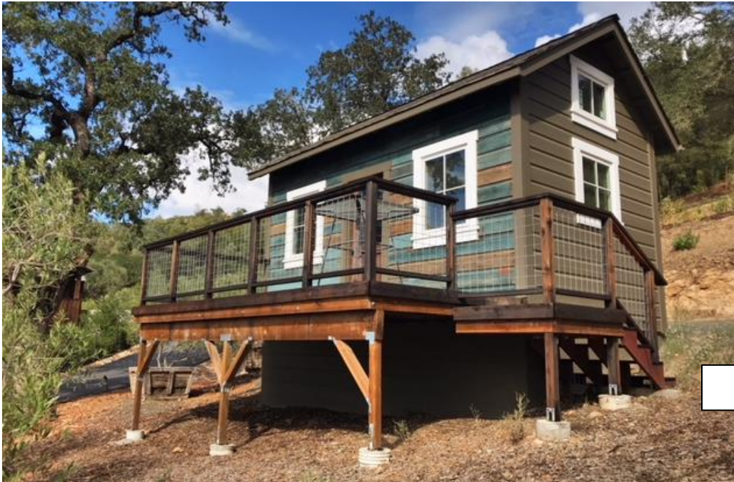
1890 Forman's Cottage Restored