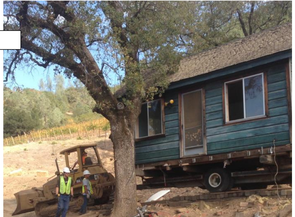
1890 Forman's Cottage Before