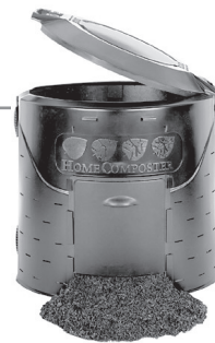
Home Composter FREE with attendance

will offer a coupon for one free cubic yard of compost for Napa residents that attend a home composting workshop ( limit one per household ).