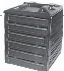
Bio-Stack Bin $20 with attendance