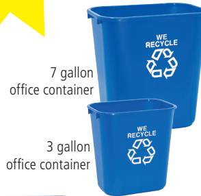
7 gallon office container 3 gallon office container