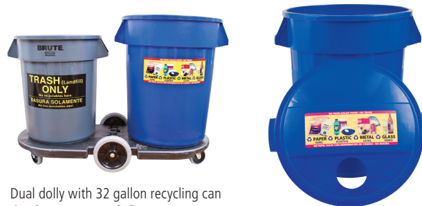
Dual dolly with 32 gallon recycling can (trash can not provided)