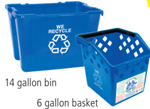
14 gallon bin 6 gallon basket