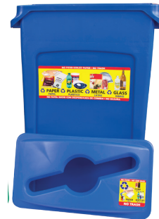
23 gallon slim-style