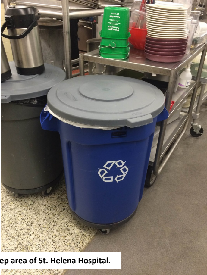
Recycling bins in the food prep area of St. Helena Hospital.