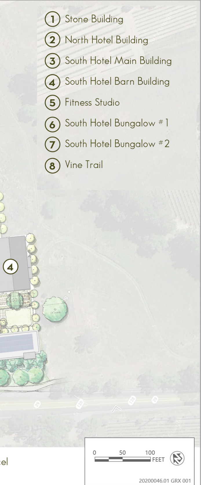
Figure 3 Proposed Site Plan