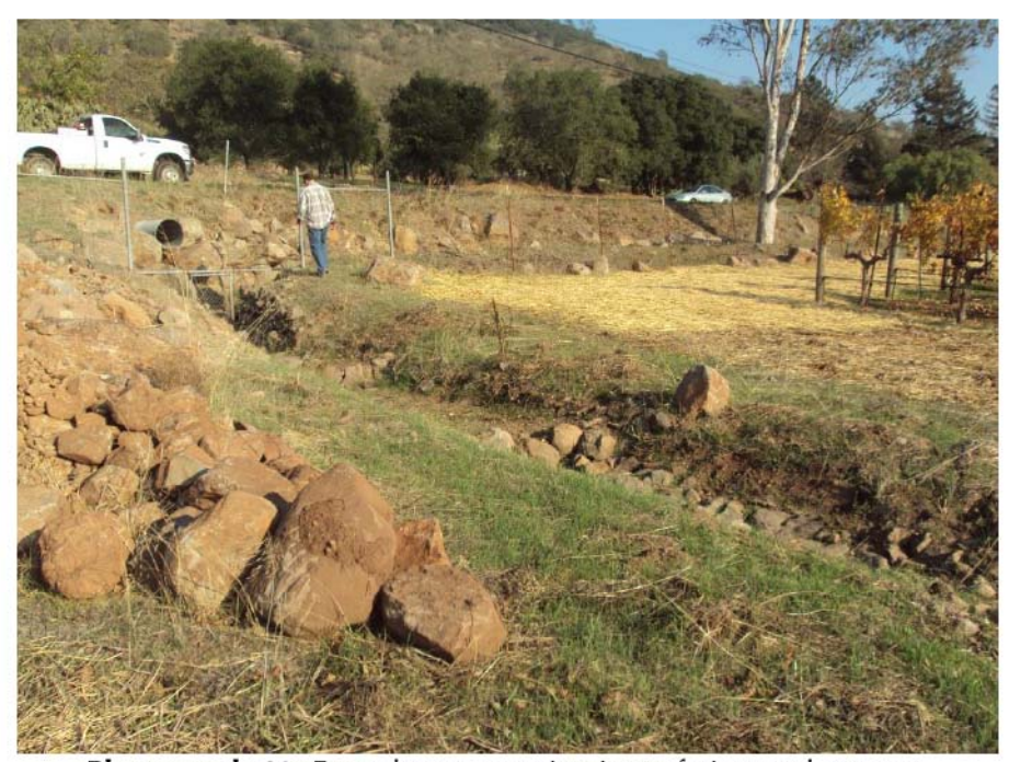
Photograph 40: Easterly panoramic view of vineyard avenue, drainage ditch and culvert through Silverado Trail November 23, 2015