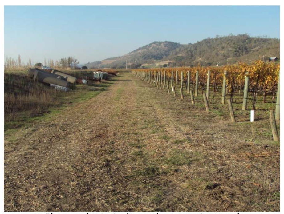
Photograph 44: Northwesterly panoramic view of vineyard, vineyard avenue and irrigation pond. November 23, 2015