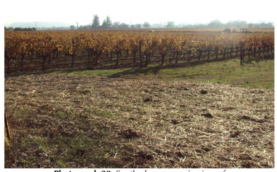
Photograph 38: Southerly panoramic view of vineyard and vineyard avenue. November 23, 2015