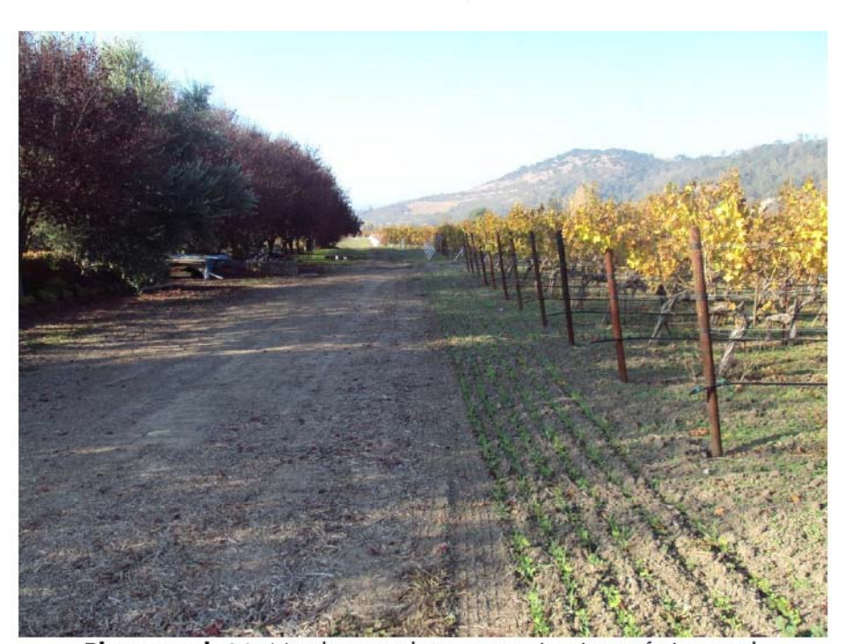
Photograph 20: Northwesterly panoramic view of vineyard, vineyard avenue and rear entrance to residential area. November 23, 2015