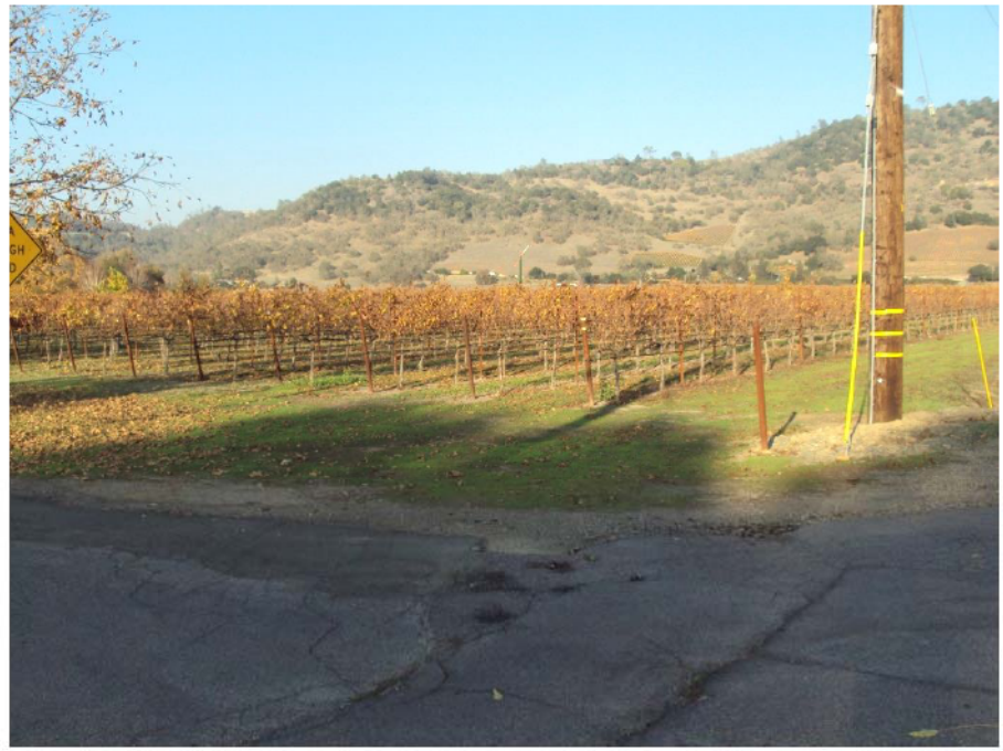
Photograph 2: Northerly panoramic view of intersection of Skellenger Lane and Ponti Road. November 23, 2015