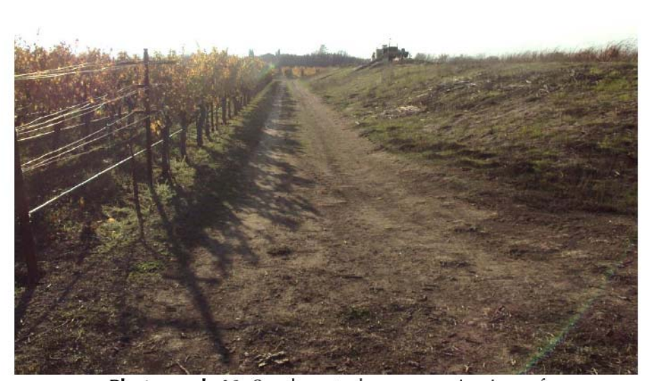
Photograph 46: Southwesterly panoramic view of vineyard, vineyard avenue and irrigation pond. November 23, 2015