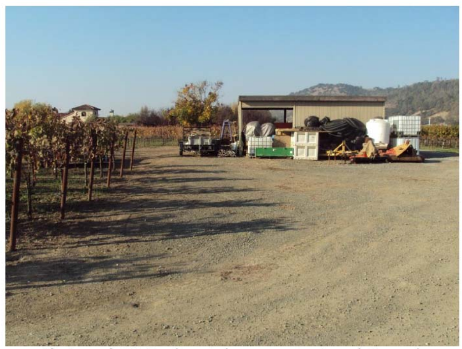
Photograph 13: Northwesterly panoramic view of vineyard, vineyard avenue and storage shed. November 23, 2015