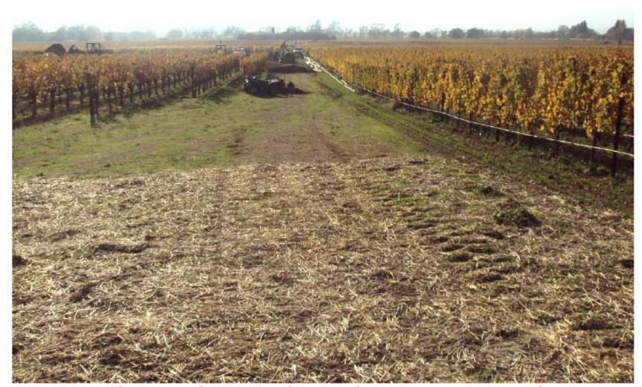
Photograph 37: Southwesterly panoramic view of vineyard and vineyard avenue. November 23, 2015