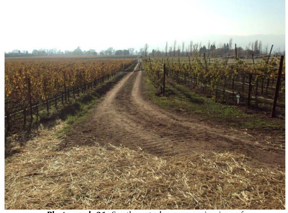
Photograph 31: Southwesterly panoramic view of vineyard and vineyard avenue. November 23, 2015