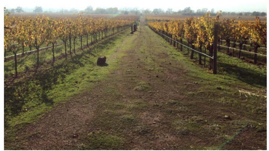
Photograph 43: Southwesterly panoramic view of vineyard and vineyard avenue. November 23, 2015