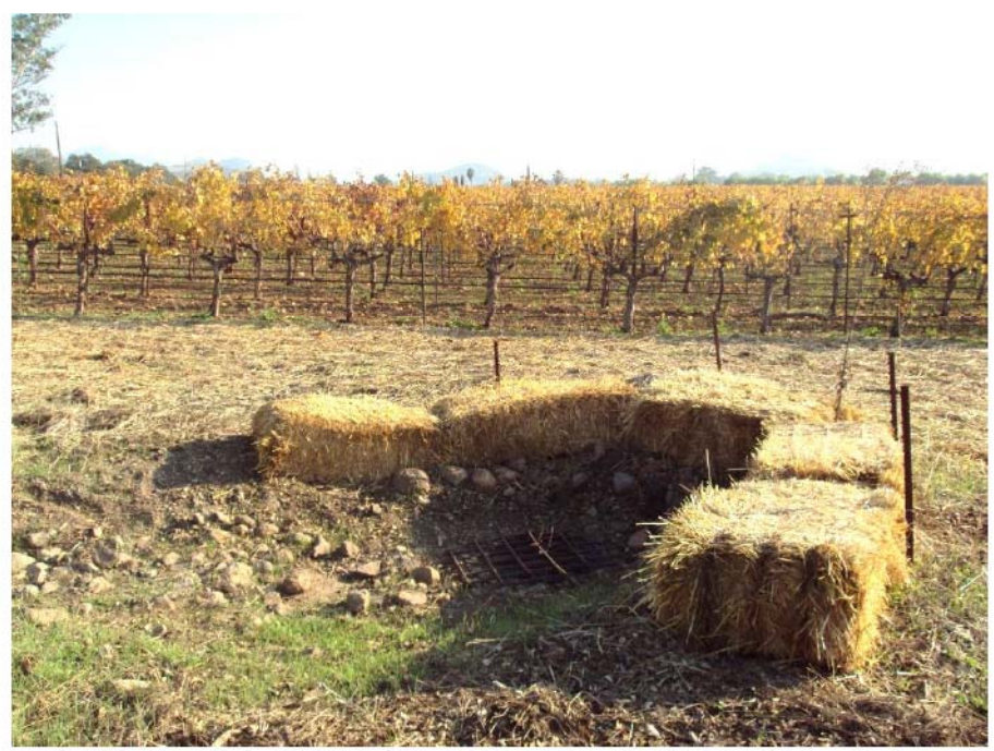
Photograph 39: Southeasterly panoramic view of vineyard, vineyard avenue and drainage ditch. November 23, 2015