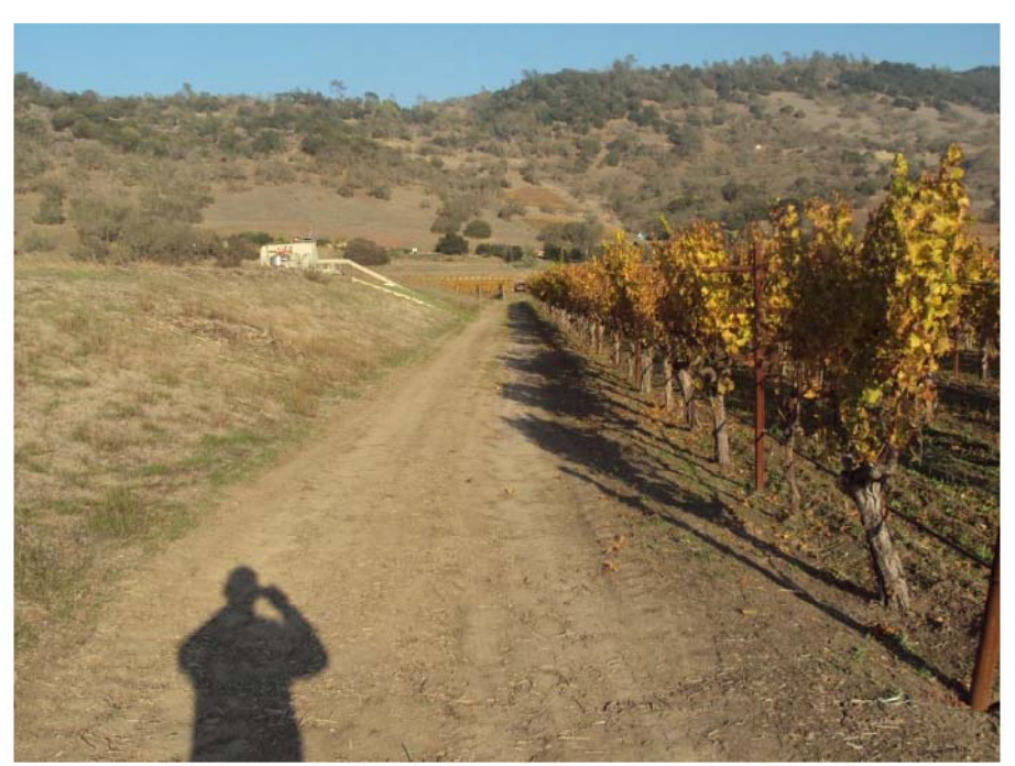
Photograph 48: Northeasterly panoramic view of vineyard, vineyard avenue and irrigation pond. November 23, 2015