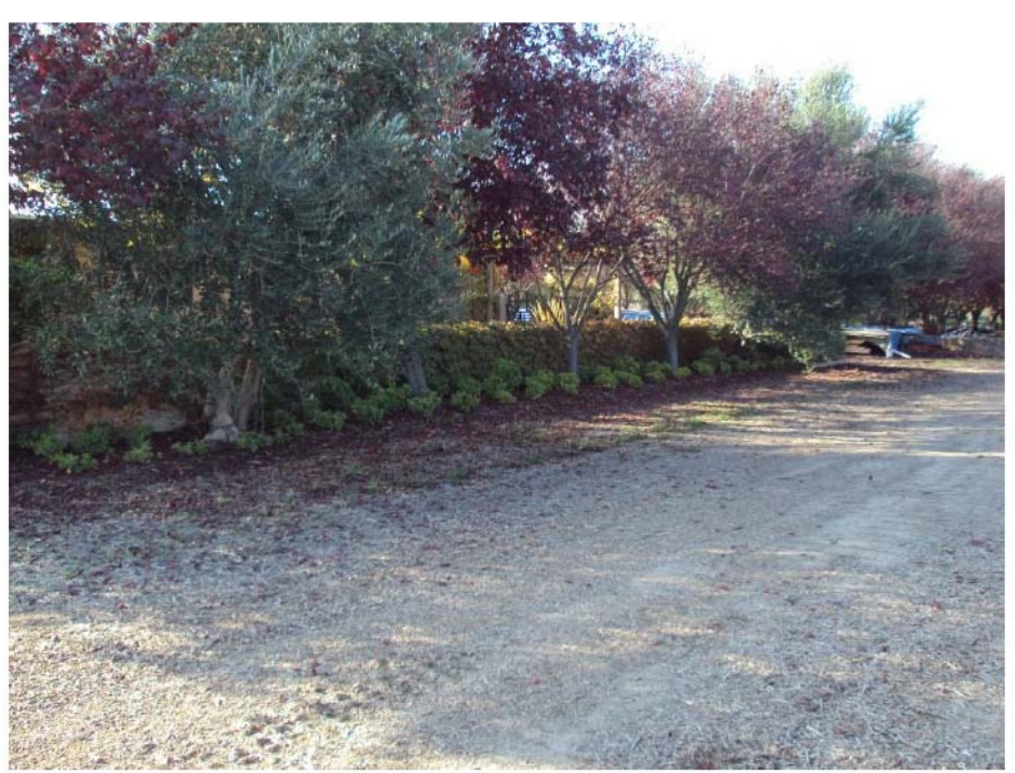
Photograph 19: Westerly panoramic view of landscaping and rear entrance to the residential area. November 23, 2015