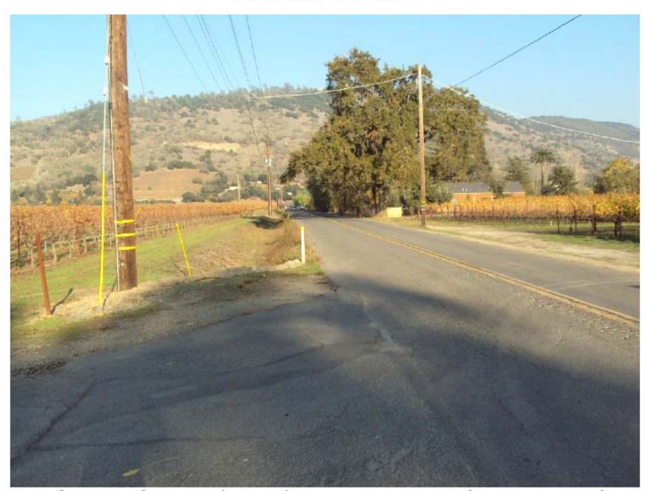
Photograph 1: Northeasterly panoramic view of intersection of Skellenger Lane and Ponti Road. November 23, 2015