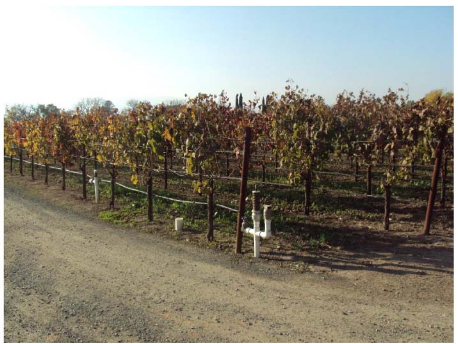
Photograph 12: Westerly panoramic view of vineyard and vineyard avenue along southern property line. November 23, 2015