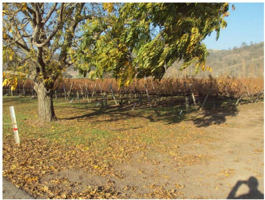
Photograph 29: Northerly panoramic view of Ponti Road and vineyard at vineyard avenue entrance to northern end of site. November 23, 2015