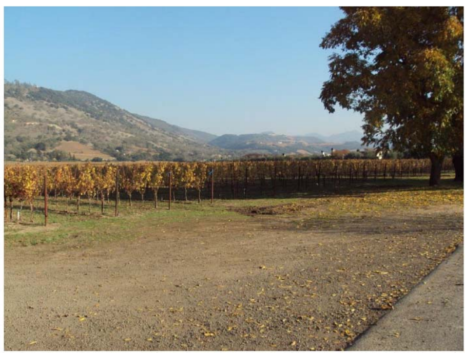
Photograph 27: Easterly panoramic view of Ponti Road and vineyard at vineyard avenue entrance to northern end of site. November 23, 2015