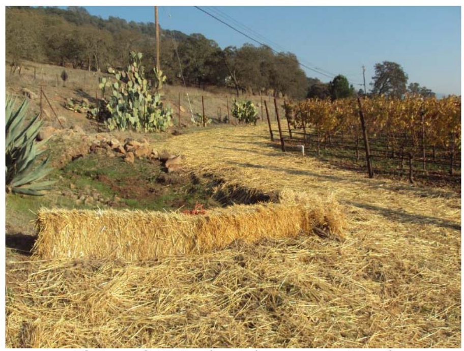
Photograph 33: Southeasterly panoramic view of vineyard and vineyard avenue. November 23, 2015