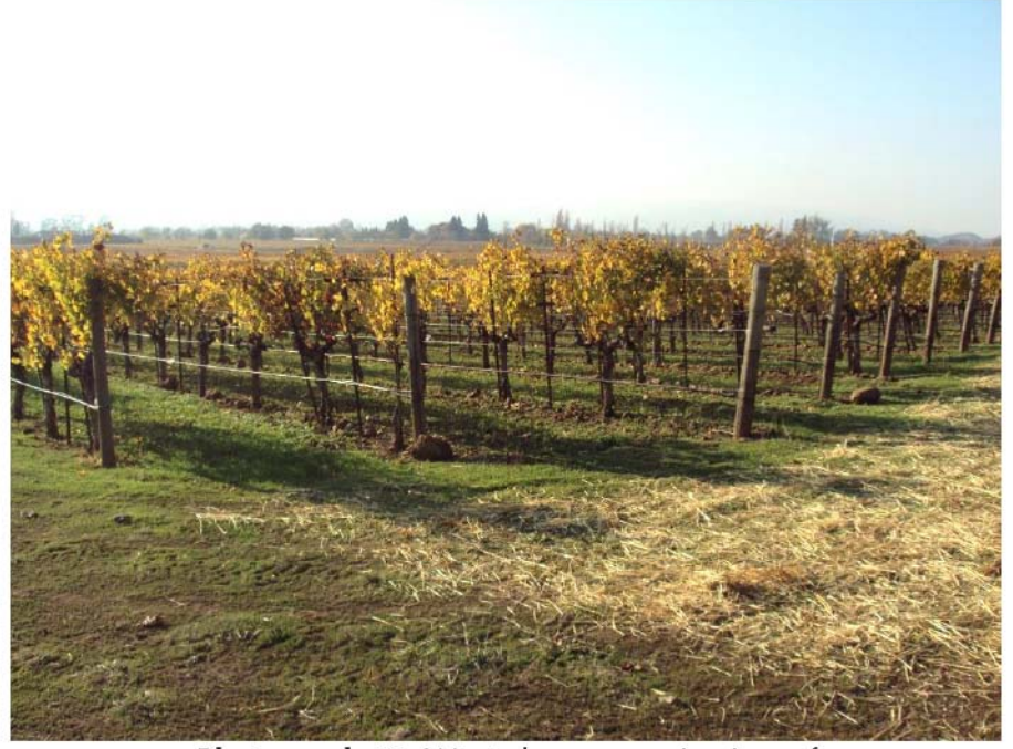
Photograph 42: Westerly panoramic view of vineyard and vineyard avenue. November 23, 2015