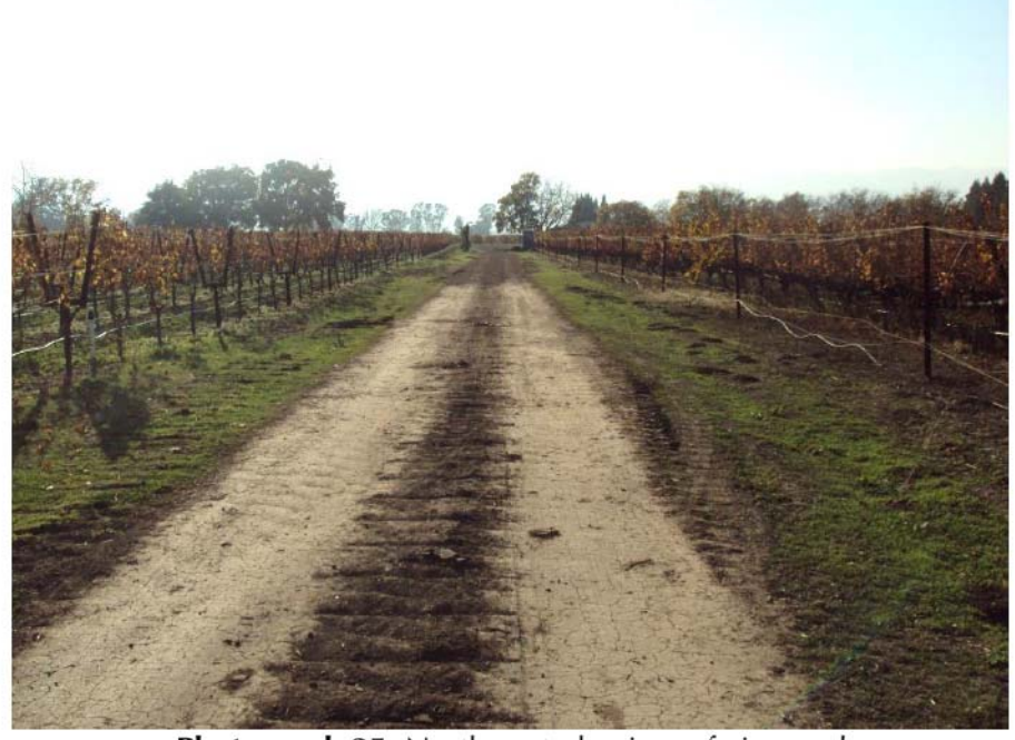
Photograph 25: Northwesterly view of vineyard and vineyard avenue along northern property line. November 23, 2015