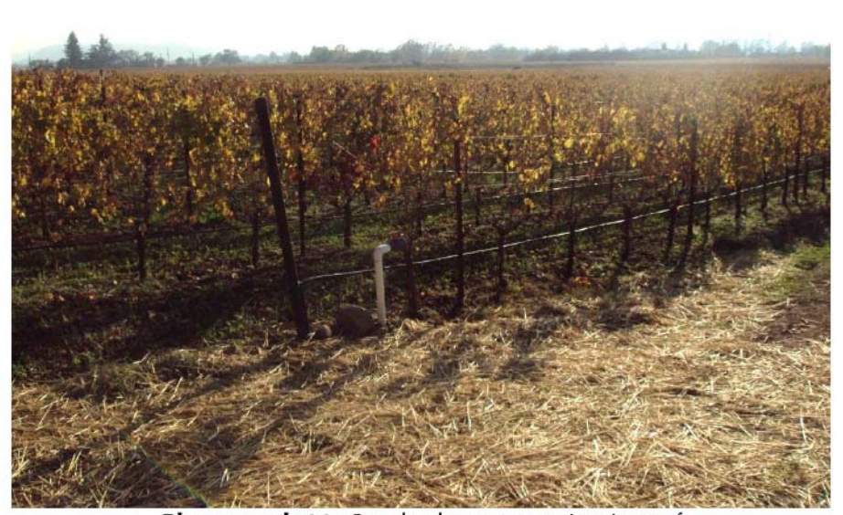
Photograph 32: Southerly panoramic view of vineyard and vineyard avenue. November 23, 2015