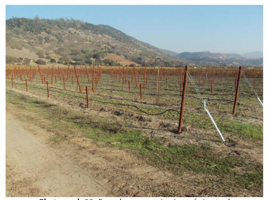
Photograph 22: Easterly panoramic view of vineyard and vineyard avenue along northern property line. November 23, 2015