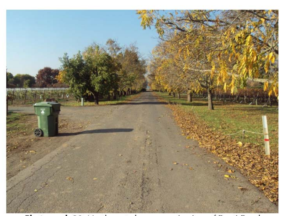
Photograph 30: Northwesterly panoramic view of Ponti Road at vineyard avenue entrance to northern end of site. November 23, 2015