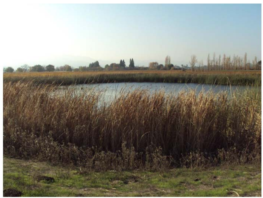
Photograph 47: Westerly view of irrigation pond. November 23, 2015