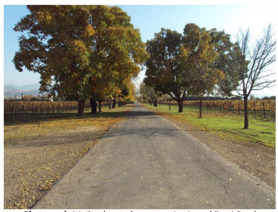
Photograph 26: Southeasterly panoramic view of Ponti Road at vineyard avenue entrance to northern end of site. November 23, 2015