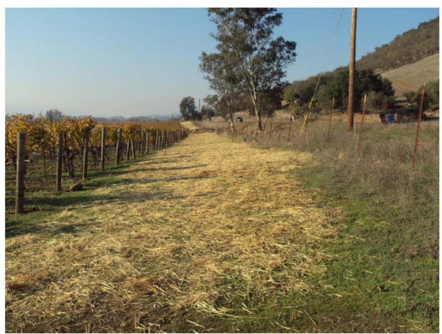
Photograph 41: Northwesterly panoramic view of vineyard and vineyard avenue. November 23, 2015