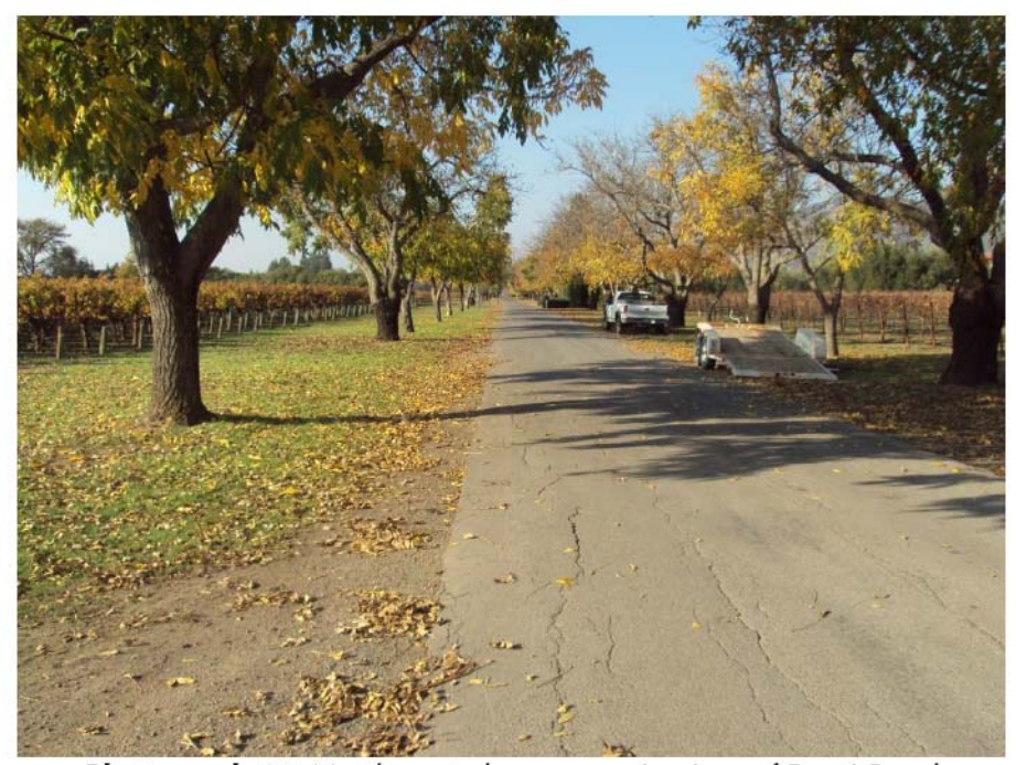
Photograph 10: Northwesterly panoramic view of Ponti Road at vineyard avenue entrance to southern end of site. November 23, 2015