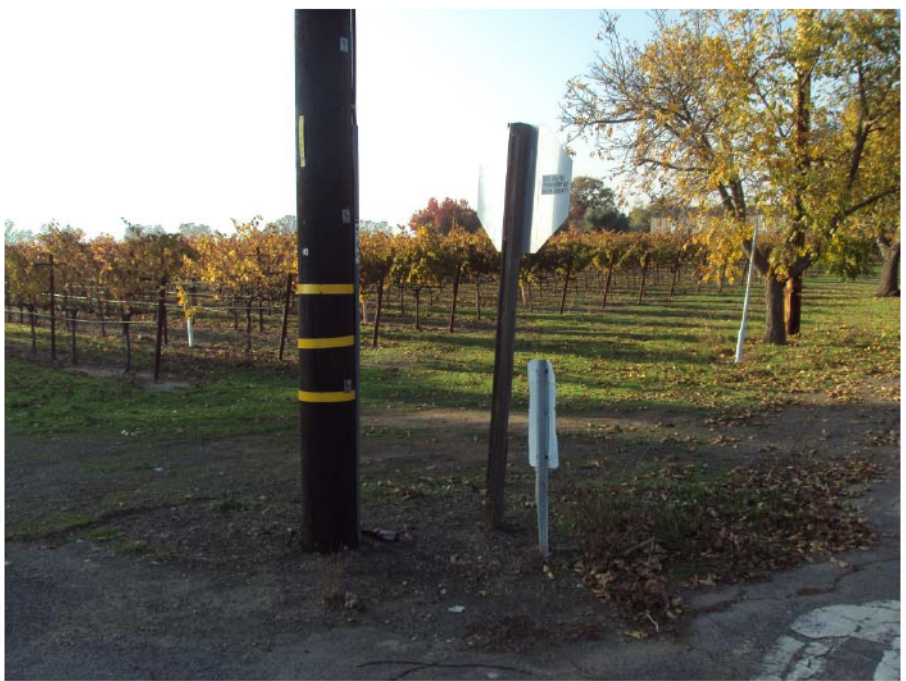
Photograph 4: Westerly panoramic view of intersection of Skellenger Lane and Ponti Road. November 23, 2015