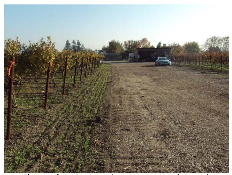
Photograph 16: Southeasterly panoramic view of vineyard, vineyard avenue and agricultural shed. November 23, 2015