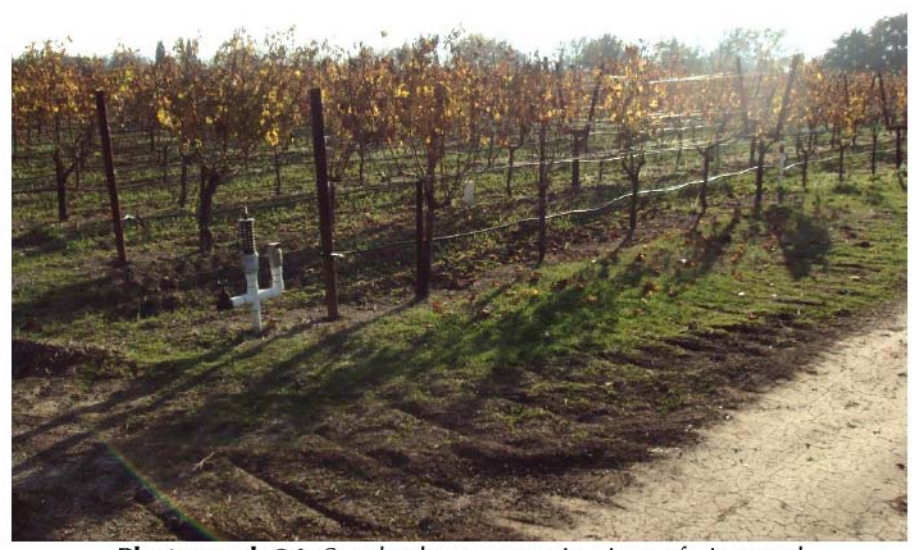
Photograph 24: Southerly panoramic view of vineyard and vineyard avenue along northern property line. November 23, 2015