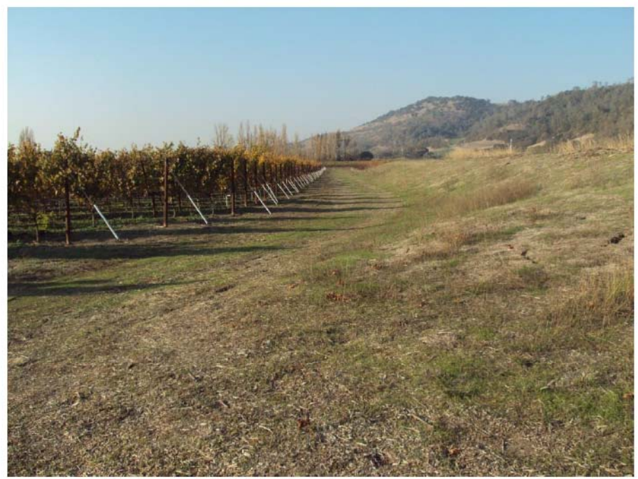
Photograph 50: Northwesterly panoramic view of vineyard, vineyard avenue and irrigation pond. November 23, 2015