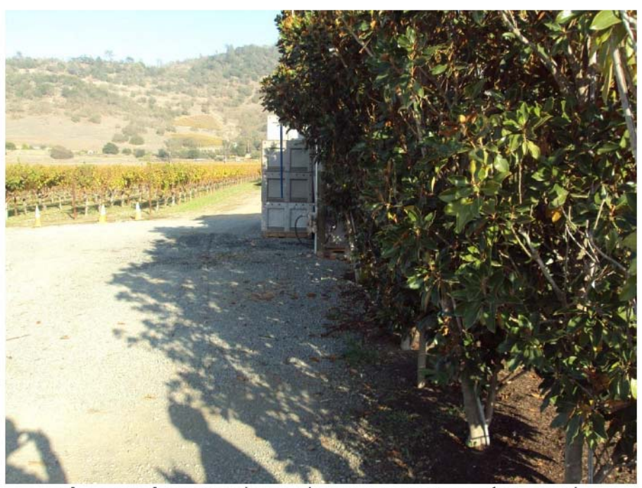
Photograph 15: Northeasterly panoramic view of vineyard, vineyard avenue and staging area. November 23, 2015