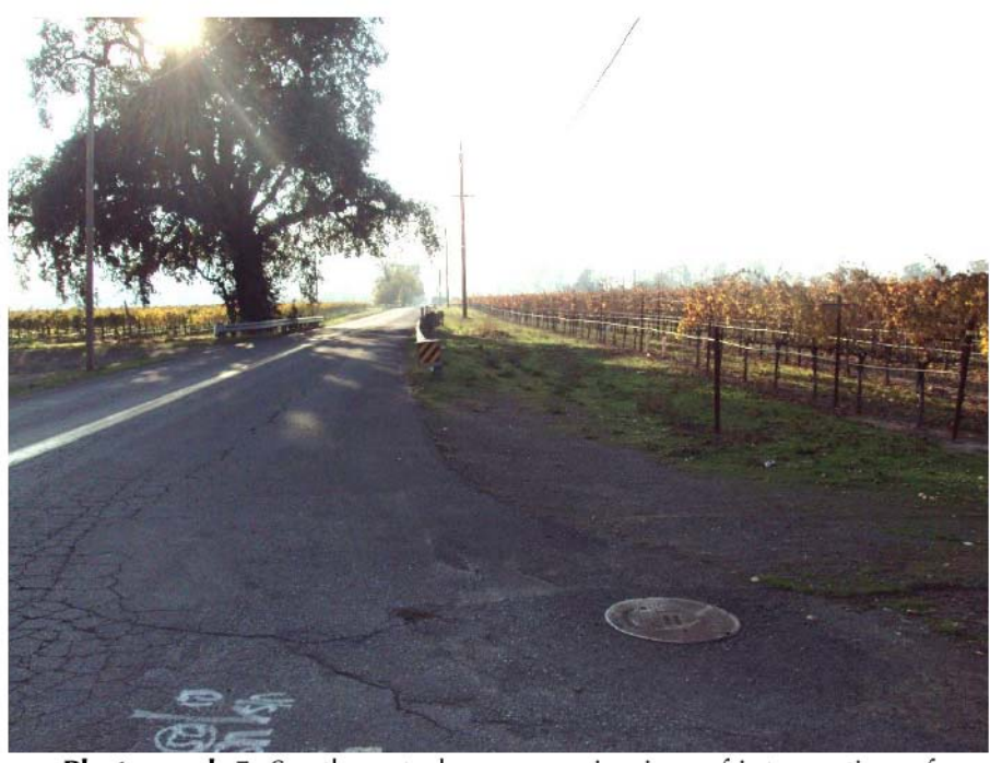
Photograph 5: Southwesterly panoramic view of intersection of Skellenger Lane and Ponti Road. November 23, 2015