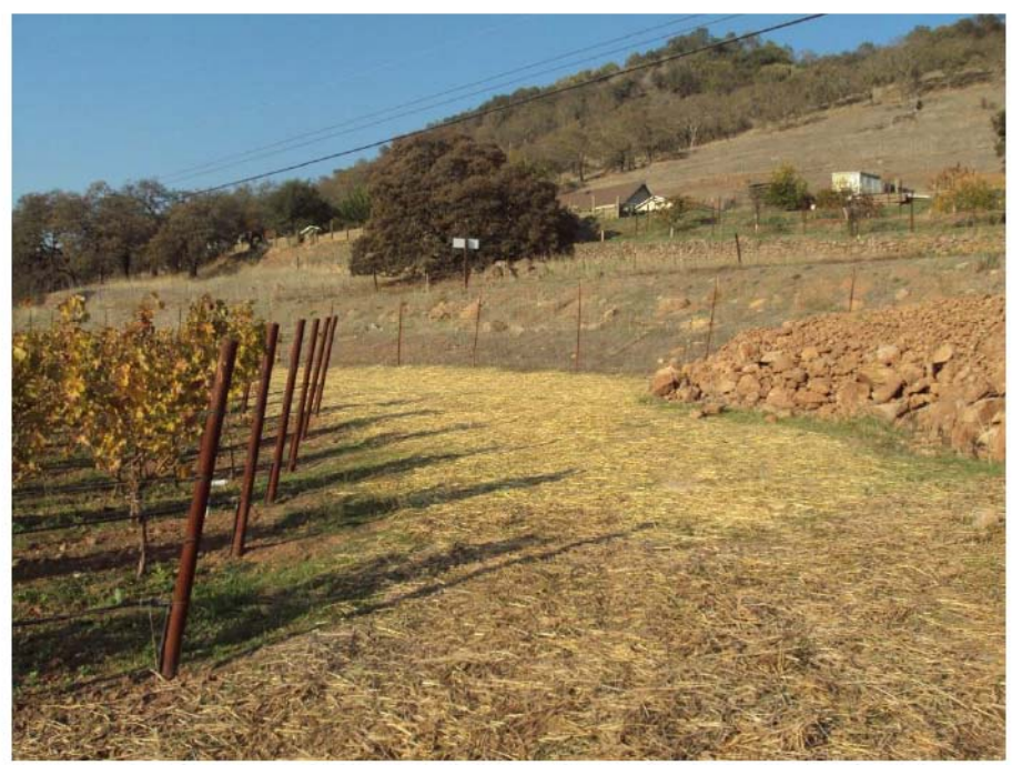
Photograph 35: Northwesterly panoramic view of vineyard and vineyard avenue. November 23, 2015