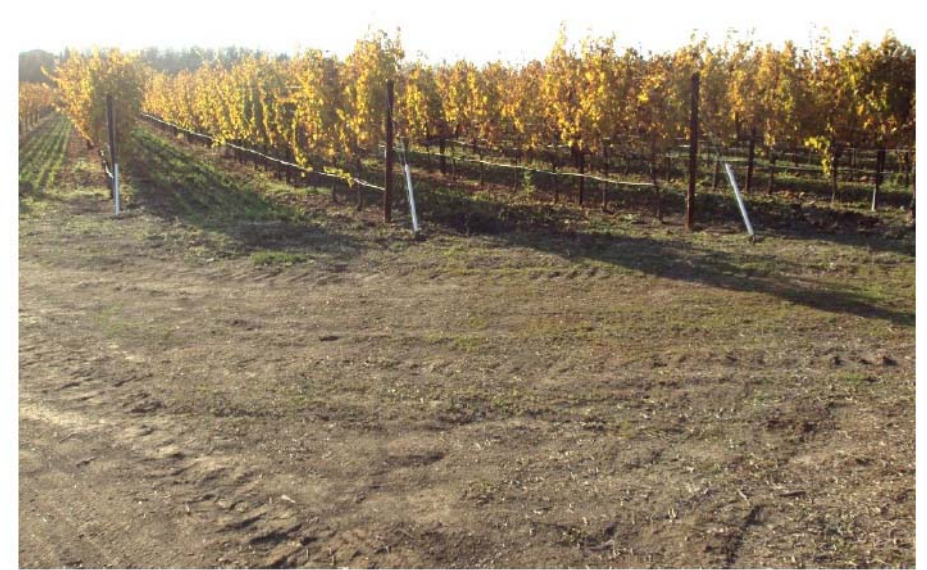
Photograph 51: Westerly panoramic view of vineyard and vineyard avenue. November 23, 2015