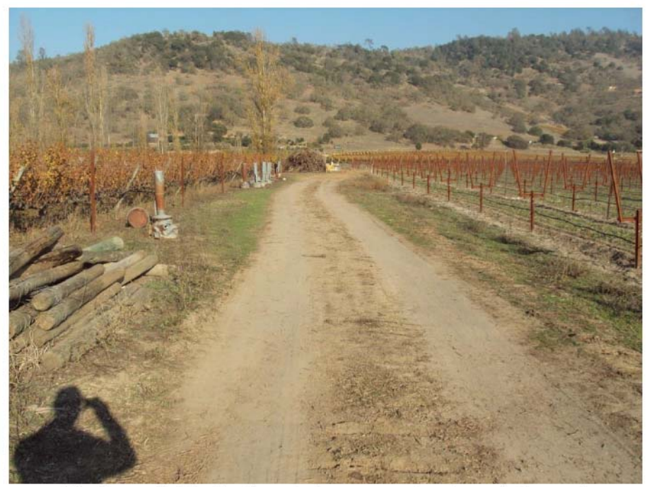
Photograph 21: Northeasterly panoramic view of vineyard and vineyard avenue along northern property line. November 23, 2015