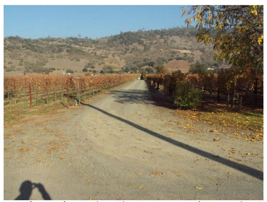
Photograph 8: Northeasterly panoramic view of Ponti Road at vineyard avenue entrance to southern end of site. November 23, 2015