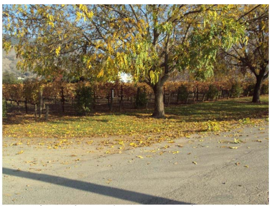
Photograph 7: Easterly panoramic view of Ponti Road at vineyard avenue entrance to southern end of site. November 23, 2015