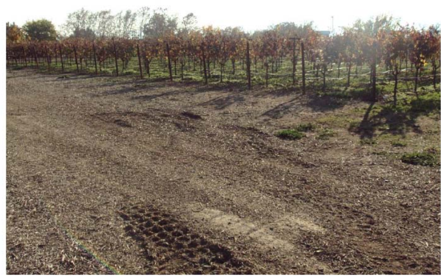
Photograph 17: Southerly panoramic view of vineyard and vineyard avenue. November 23, 2015