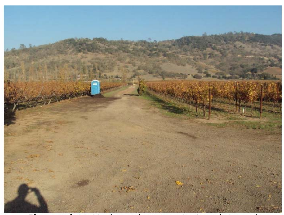
Photograph 28: Northeasterly panoramic view of vineyard and vineyard avenue entrance to northern end of site. November 23, 2015