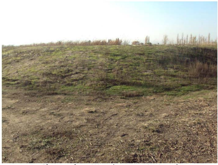
Photograph 45: Westerly panoramic view of vineyard, vineyard avenue and irrigation pond. November 23, 2015