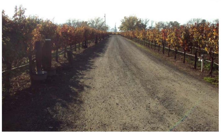
Photograph 11: Southwesterly panoramic view of vineyard and vineyard avenue along southern property line. November 23, 2015