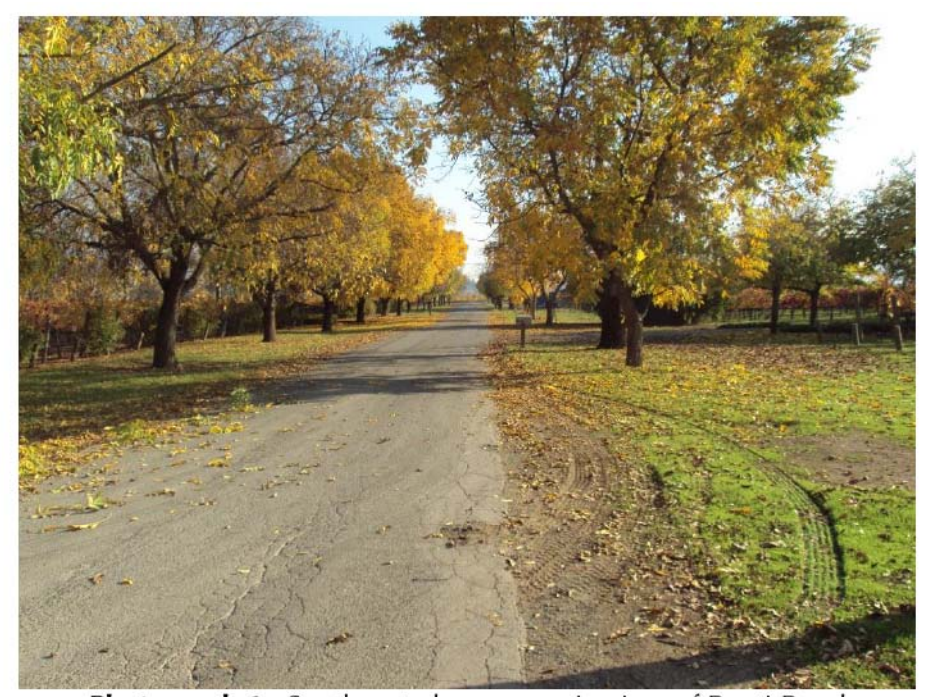
Photograph 6: Southeasterly panoramic view of Ponti Road at vineyard avenue entrance to southern end of site. November 23, 2015