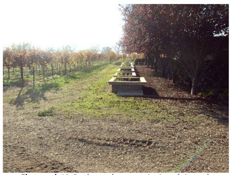
Photograph 18: Southwesterly panoramic view of vineyard, vineyard avenue and raised planters. November 23, 2015