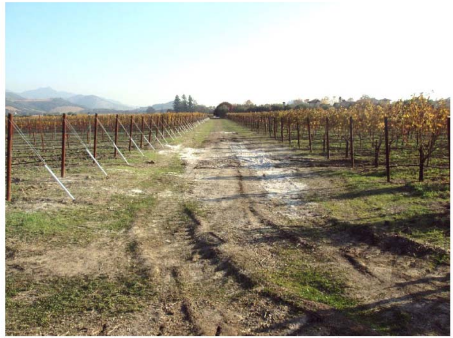
Photograph 23: Southeasterly panoramic view of vineyard and intersecting vineyard avenues along northern property line. November 23, 2015