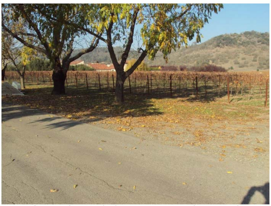
Photograph 9: Northerly panoramic view of Ponti Road at vineyard avenue entrance to southern end of site. November 23, 2015