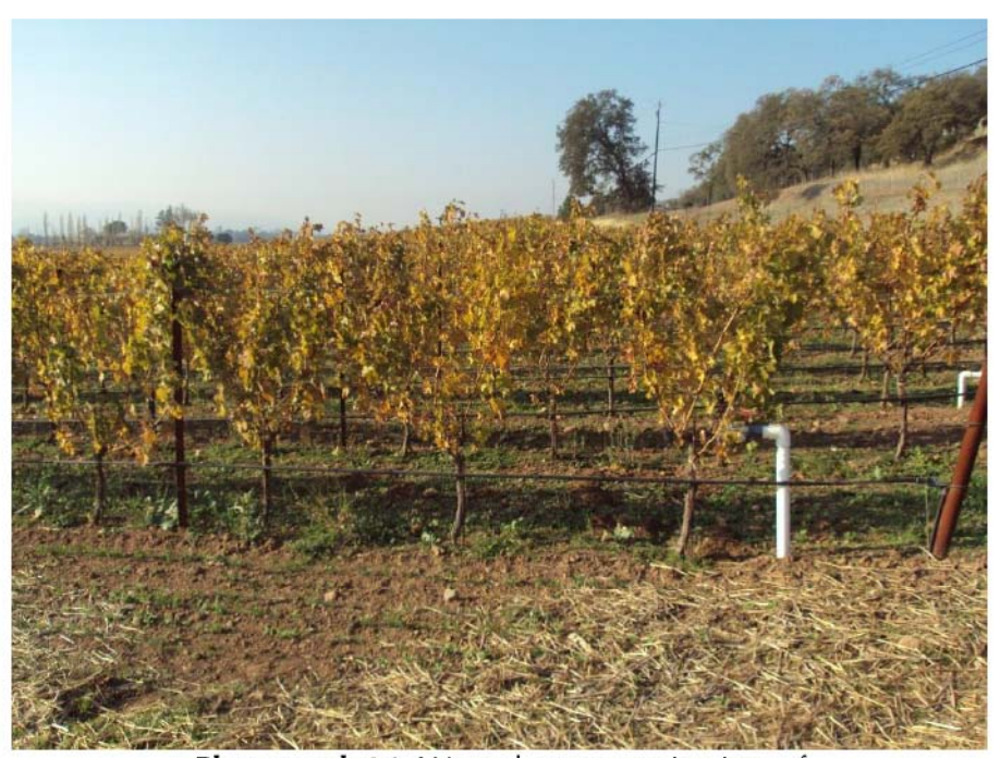
Photograph 36: Westerly panoramic view of vineyard and vineyard avenue. November 23, 2015