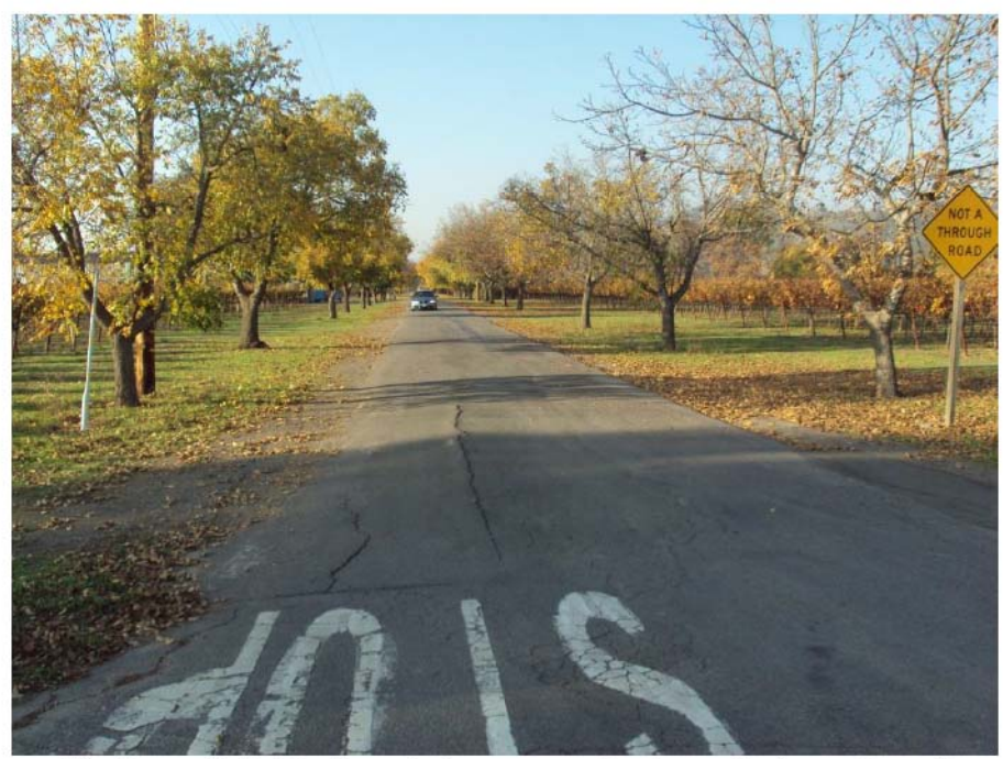
Photograph 3: Northwesterly panoramic view of intersection of Skellenger Lane and Ponti Road. November 23, 2015