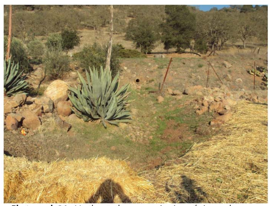
Photograph 34: Northeasterly panoramic view of vineyard avenue and drainage culvert through Silverado Trail. November 23, 2015