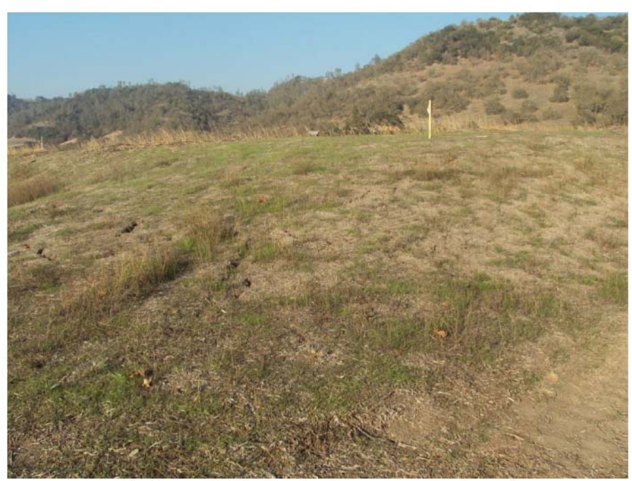
Photograph 49: Northerly panoramic view of vineyard, vineyard avenue and irrigation pond. November 23, 2015