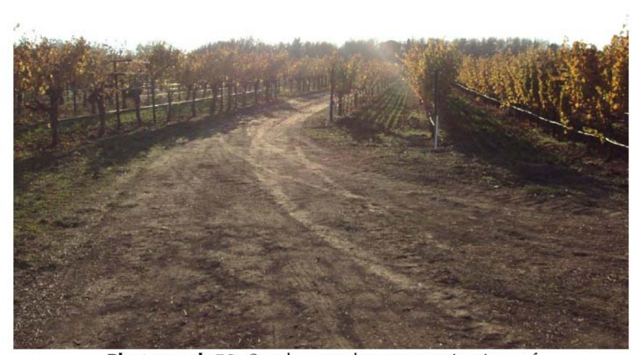
Photograph 52: Southwesterly panoramic view of vineyard and vineyard avenue. November 23, 2015