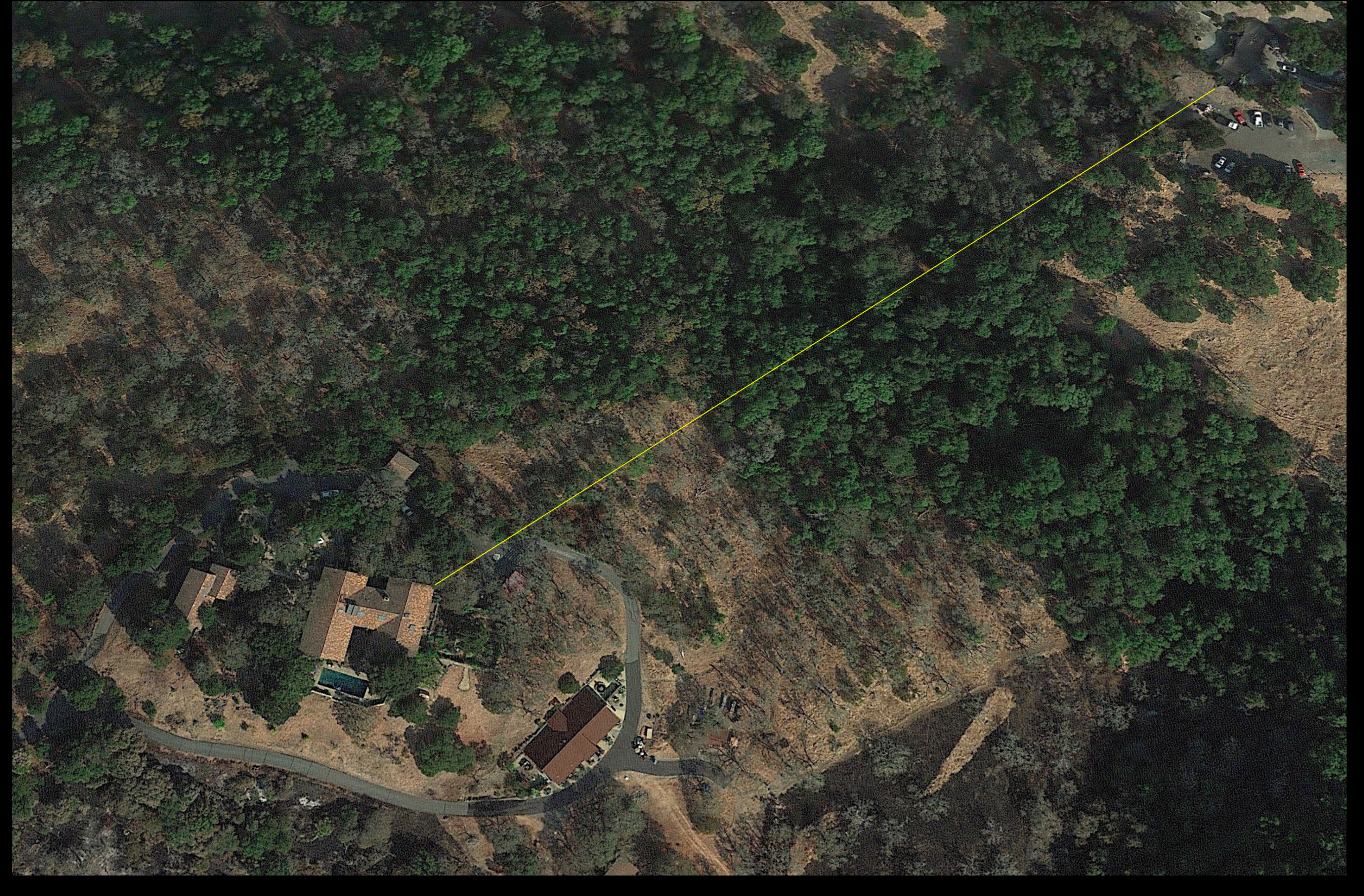
• 905 feet — line of sights and sound from 199 Kreuzer to Caldwell Cave fans, 822 to parking lot