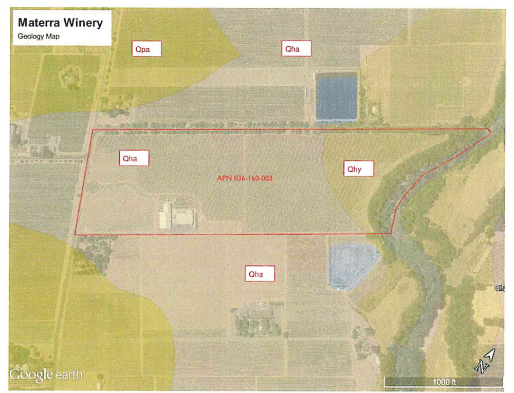
Figure 2: Geology Map Created with Google Earth Pro

Since all groundwater extraction is from the Napa Valley Floor area we have evaluated the screening criteria associated with the Napa Valley Floor.