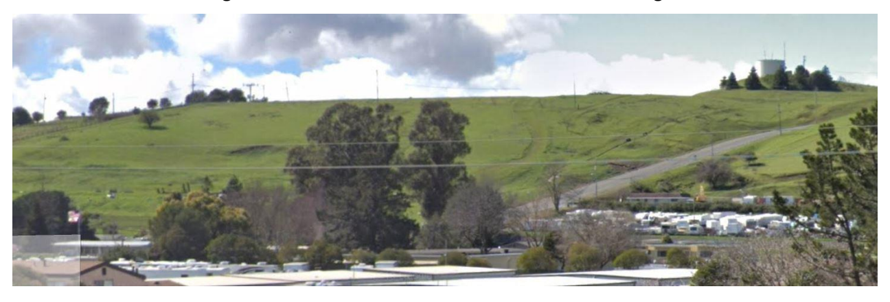
Figure 1 – View of Oat Hill from SR-29@ Railroad Bridge