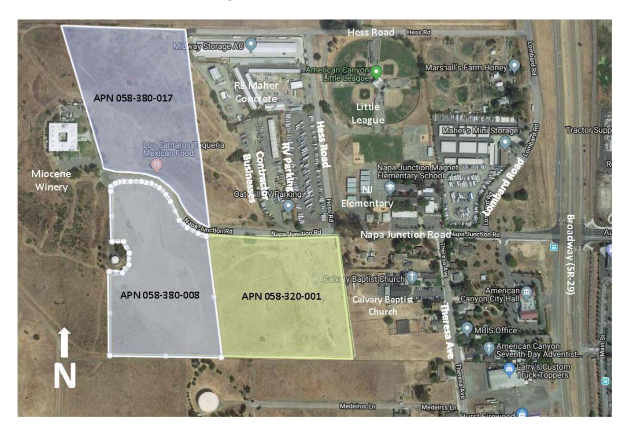
Figure 2 – Aerial View of Oat Hill

An aerial view of the property is shown in Figure 2 below: