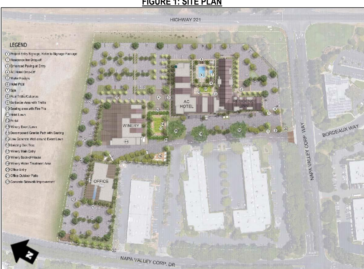
FIGURE 1: SITE PLAN